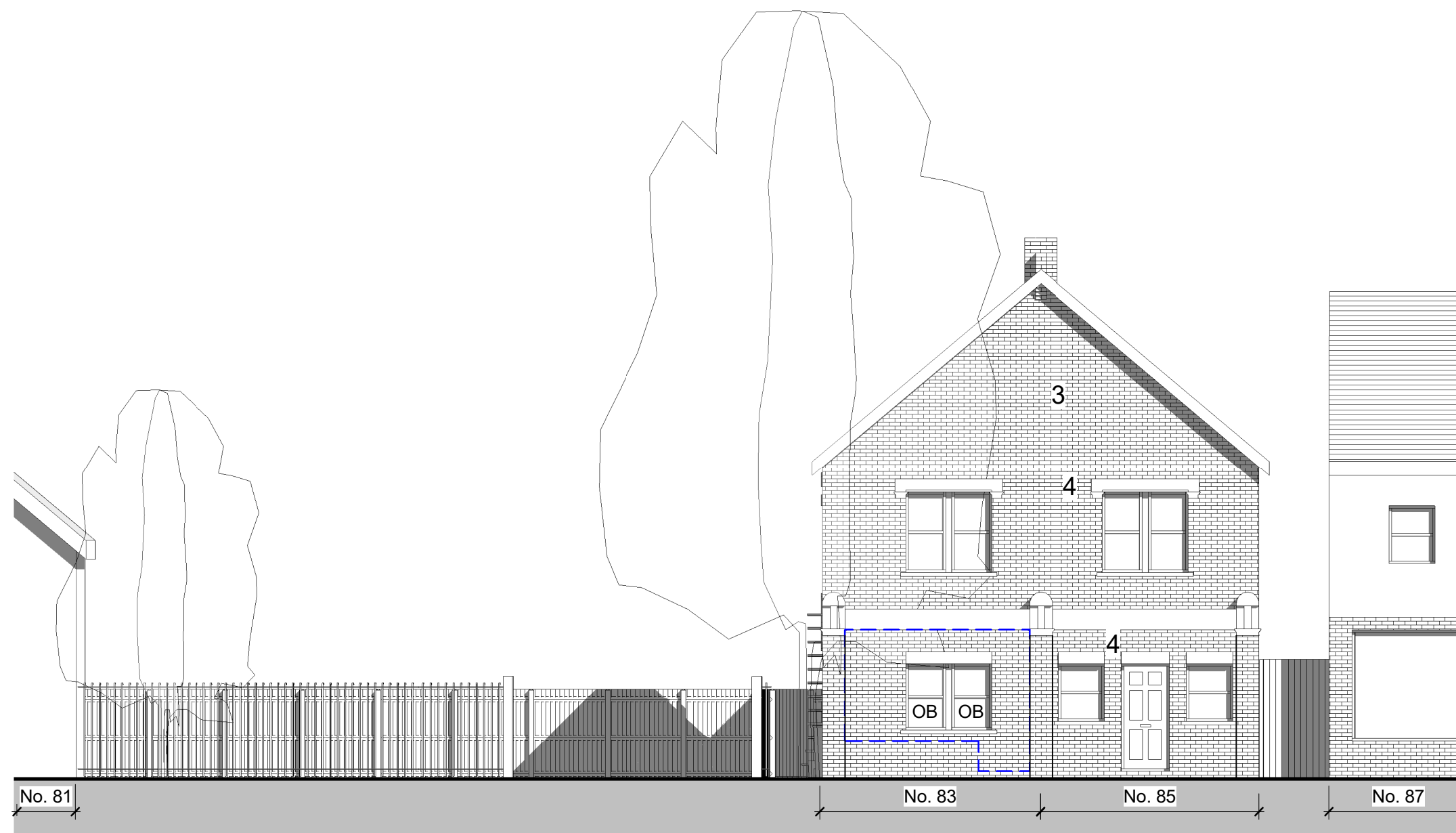
PROPOSED NORTH ELEVATION 1 : 100