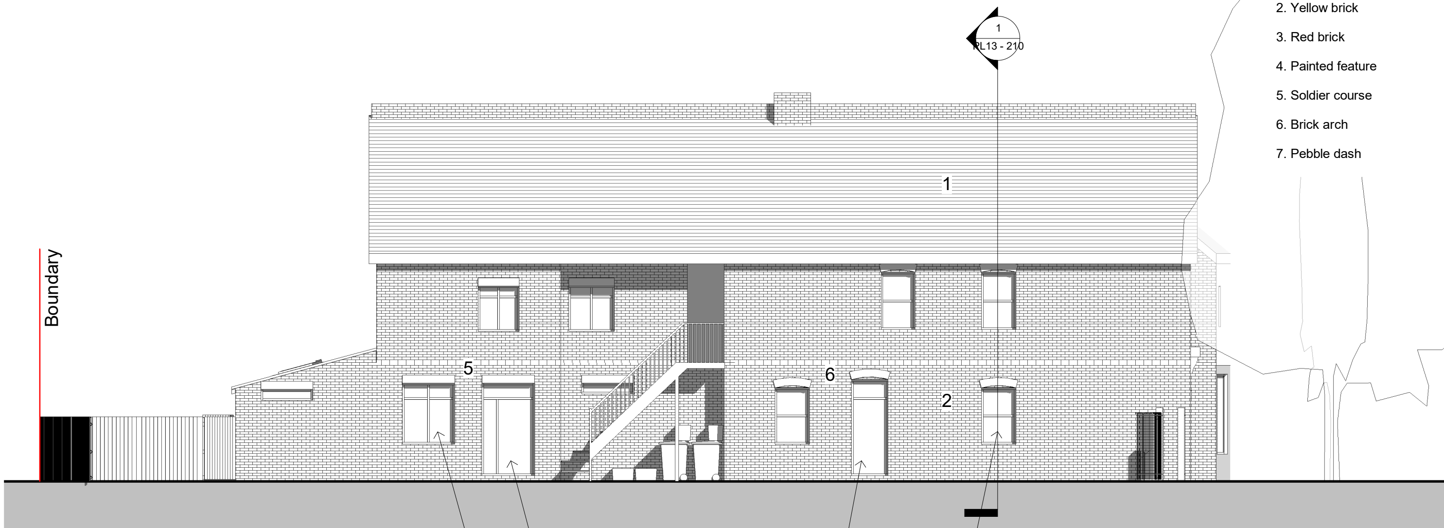
PROPOSED EAST ELEVATION 1 : 100

new door under existing brick soldier new door replaces existing brick infill new window under existing brick soldier new window