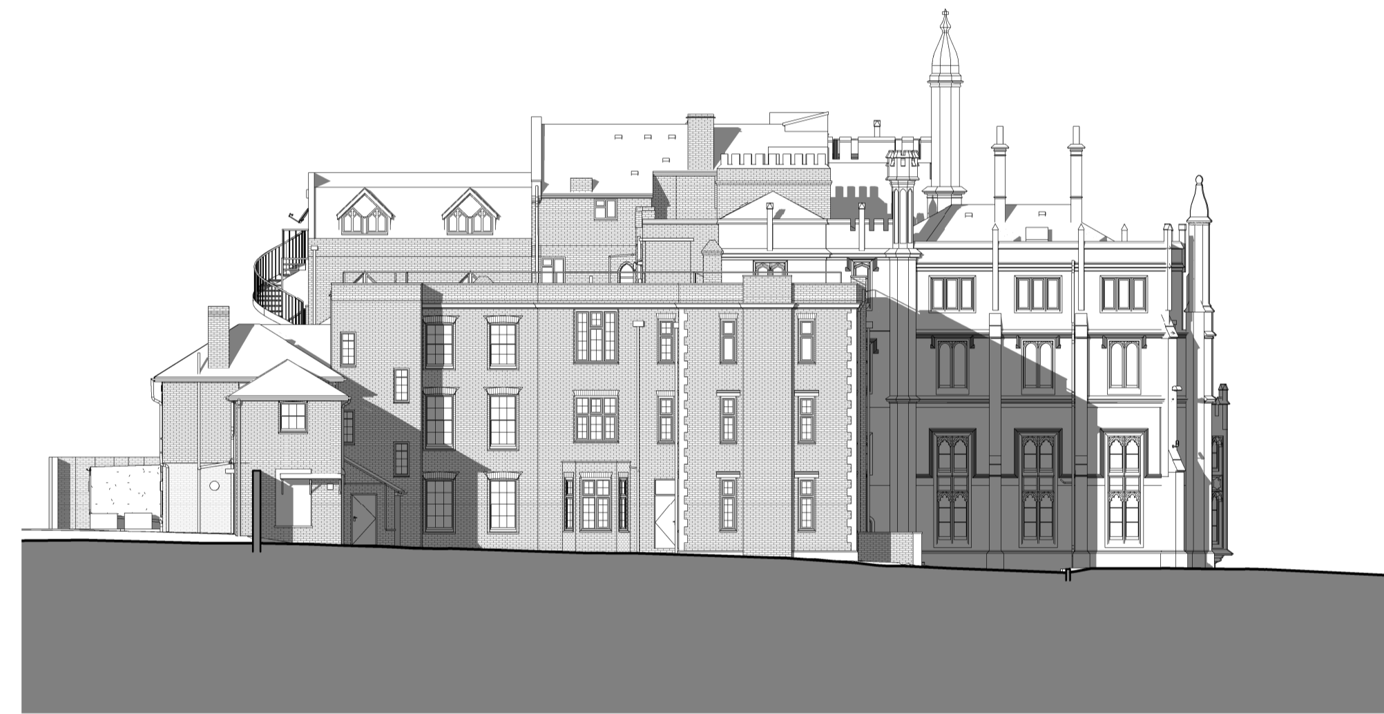
3 Main Building South East Elevation - Existing 1:200