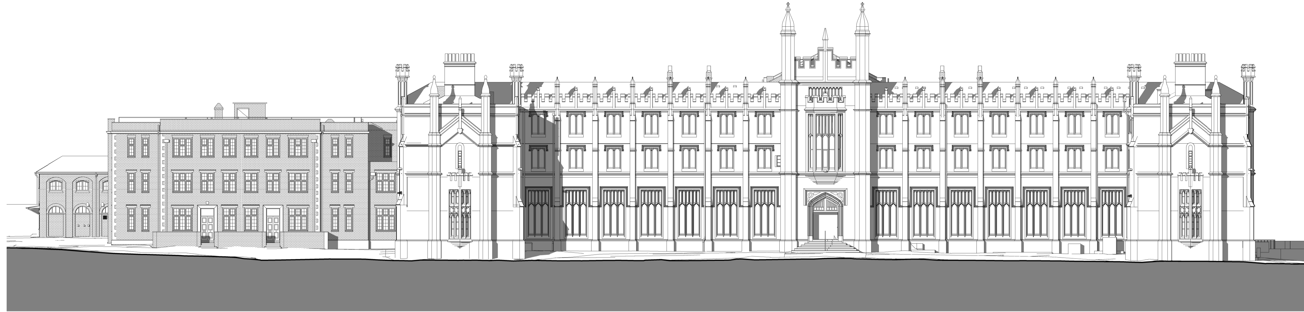
1 Main Building North East Elevation - Existing 1:200