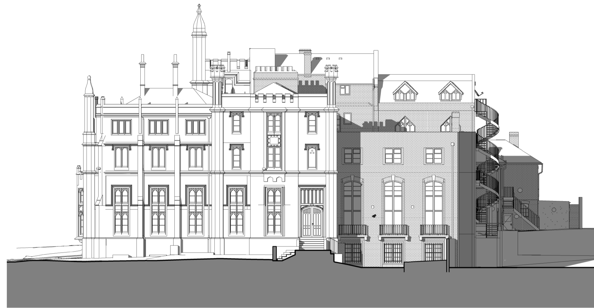
2 Main Building North West Elevation - Existing 1:200