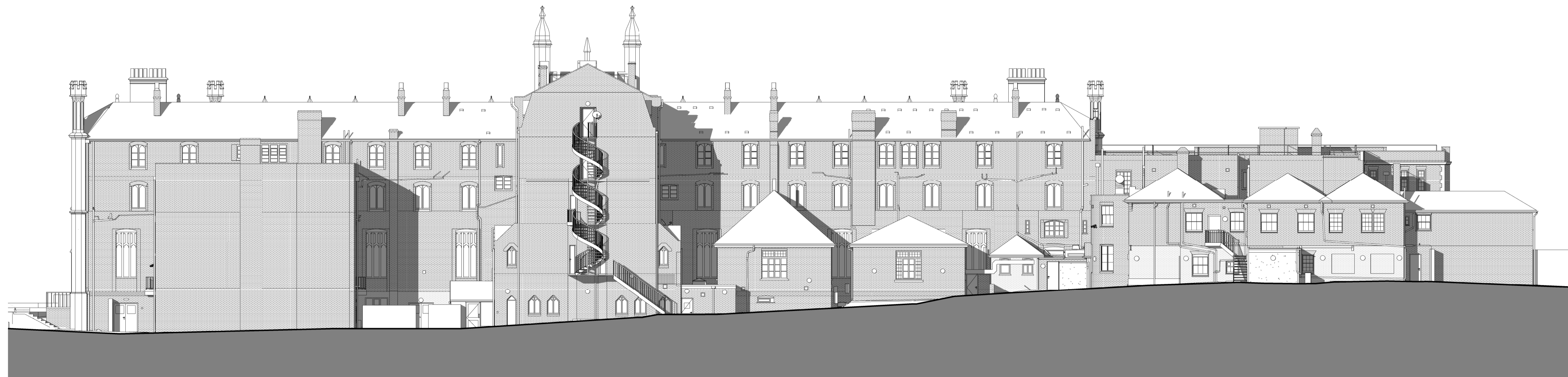
4 Main Building South West Elevation - Existing 1:200