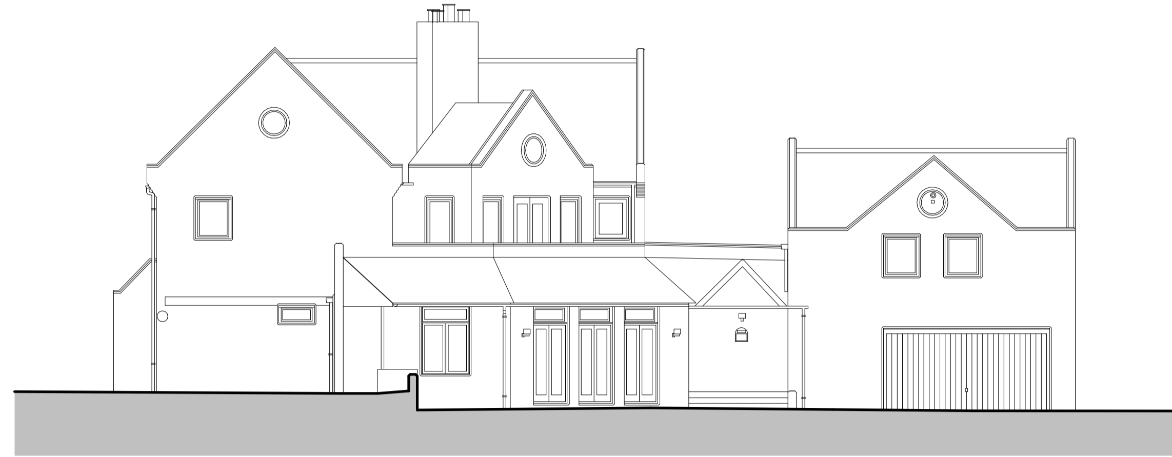
4 Orchard House South West Elevation - Existing 1:100