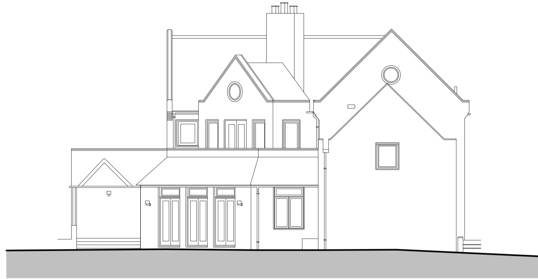
3 Orchard House South East Elevation - Existing 1:100