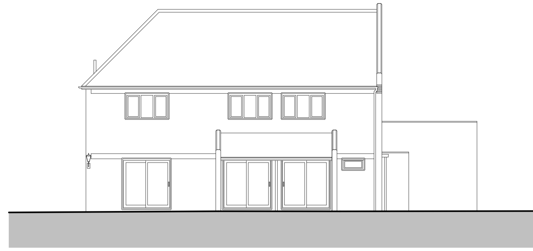
2 Orchard House North West Elevation - Existing 1:100