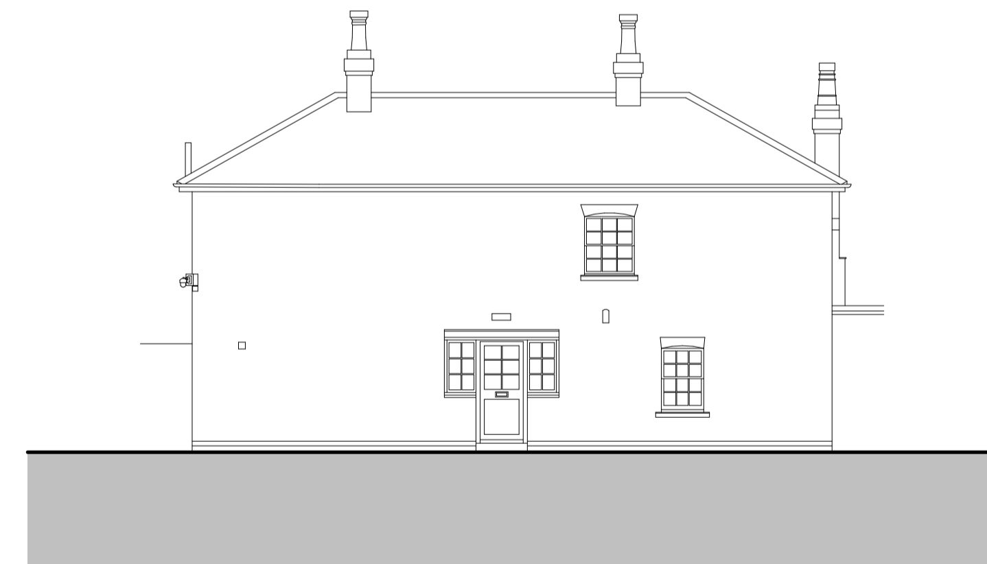
12 Upper Cottage South West Elevation - Existing 1:100