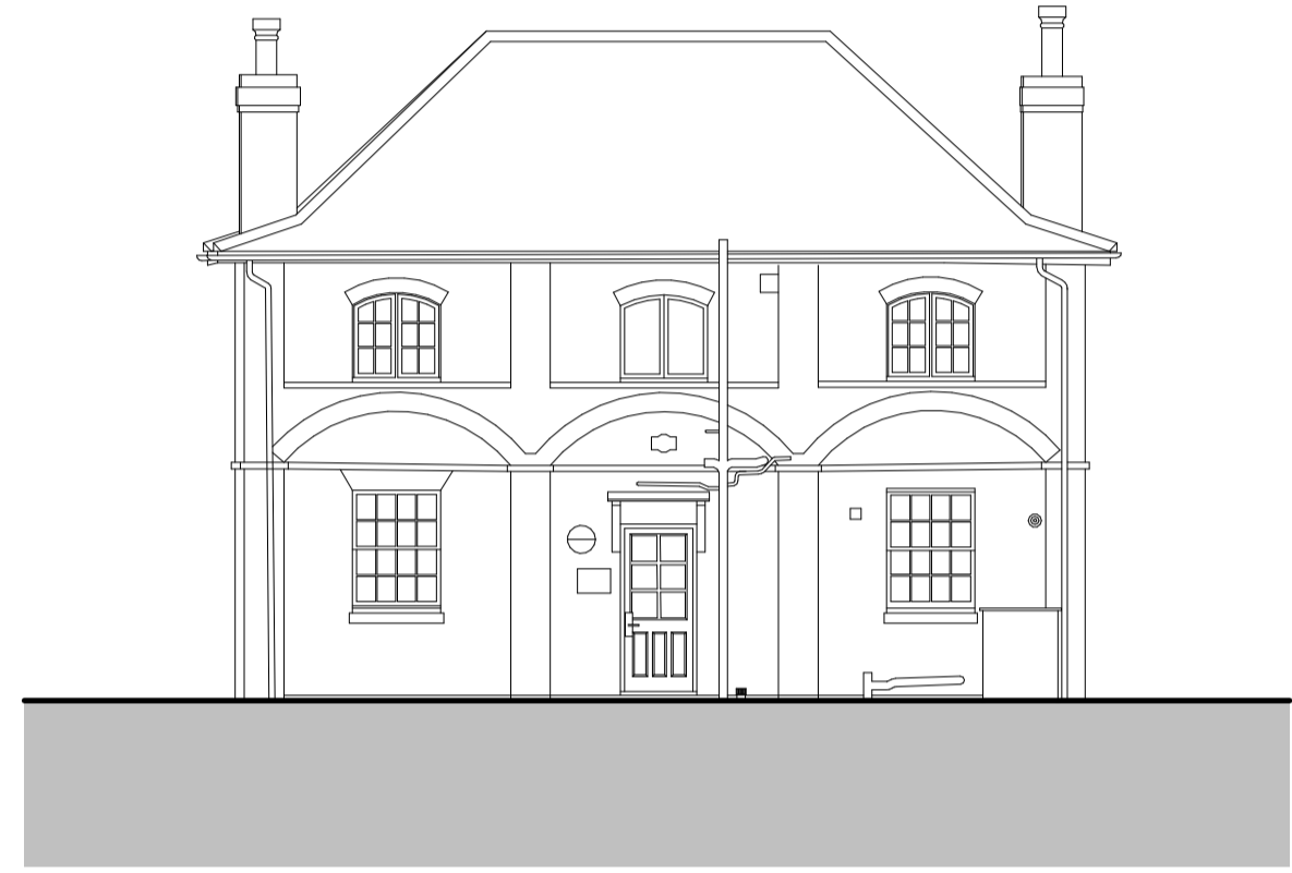
5 Lower Cottage North East Elevation - Proposed 1:100