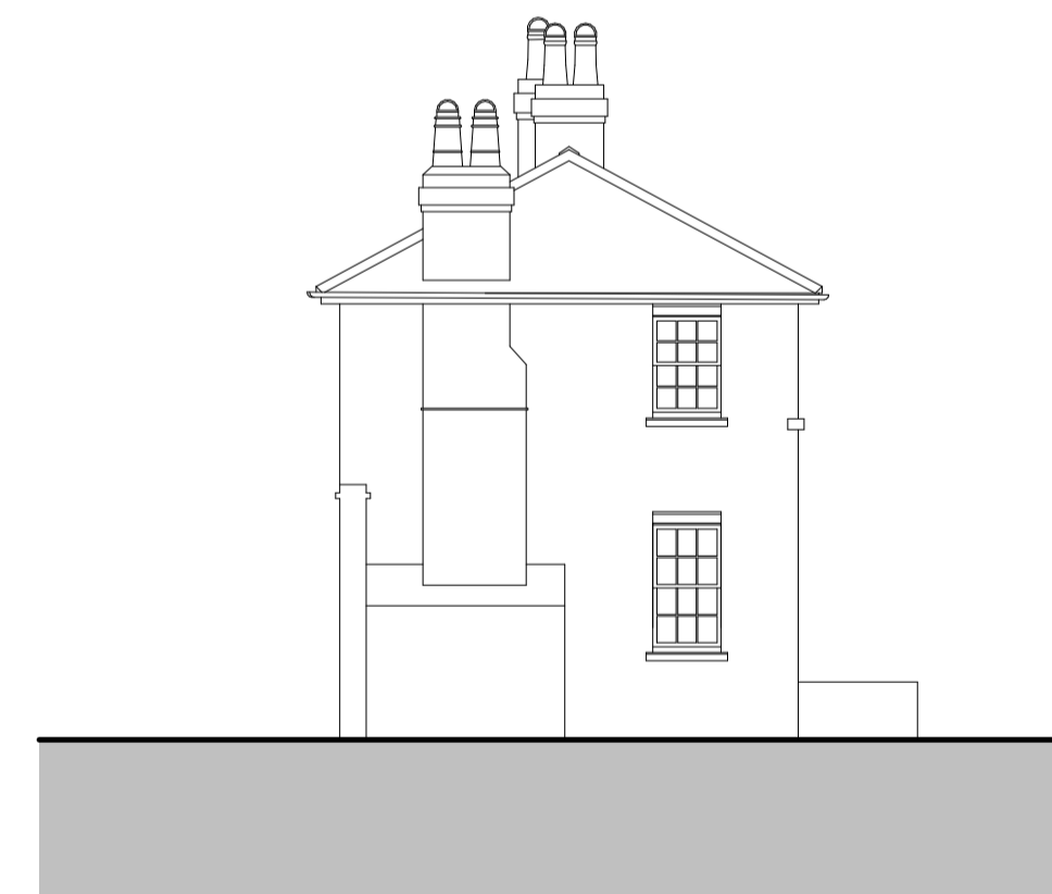
11 Upper Cottage South East Elevation - Existing 1:100