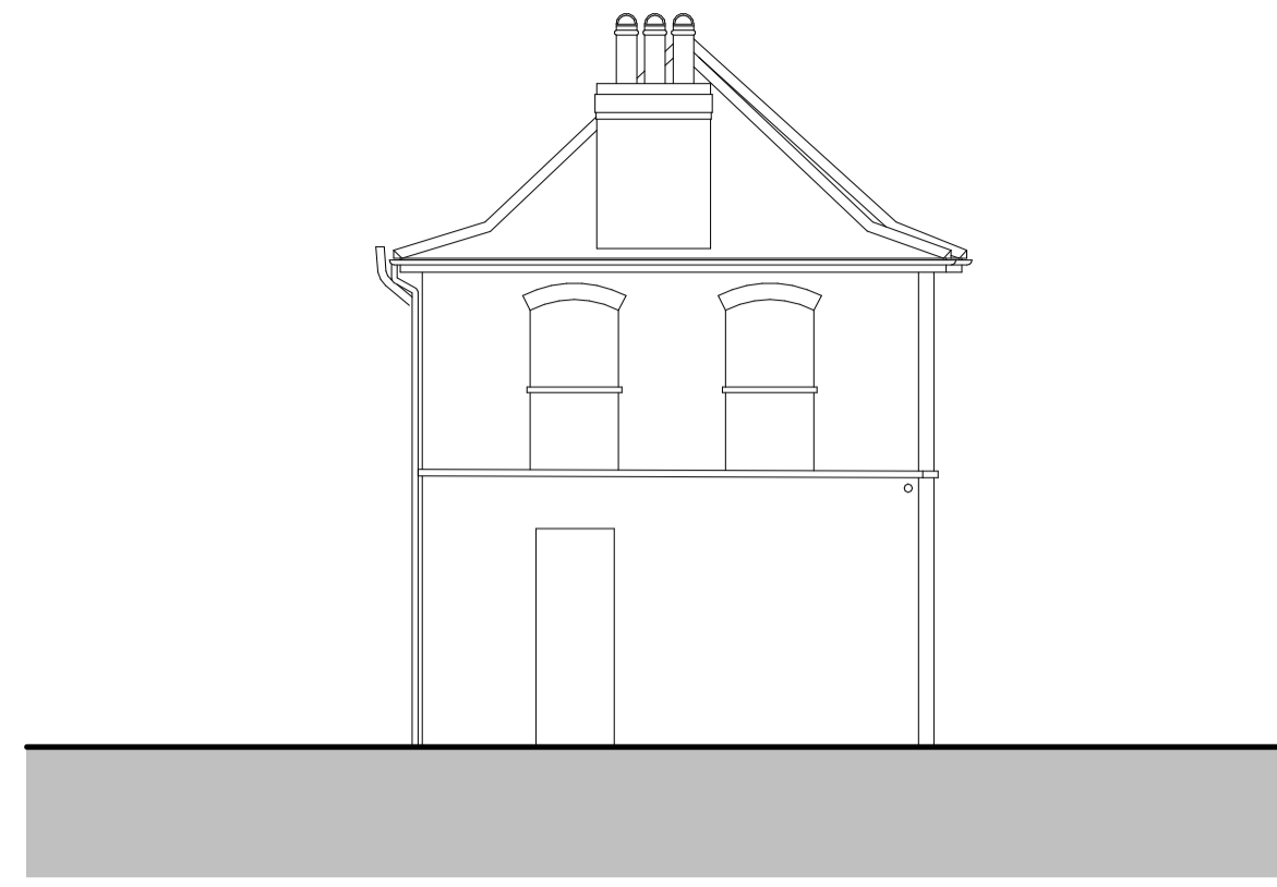
3 Lower Cottage South East Elevation - Existing 1:100