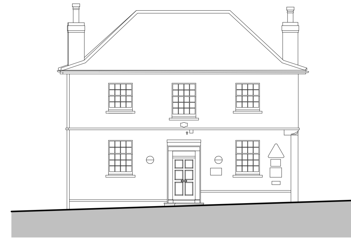
4 Lower Cottage South West Elevation - Existing 1:100