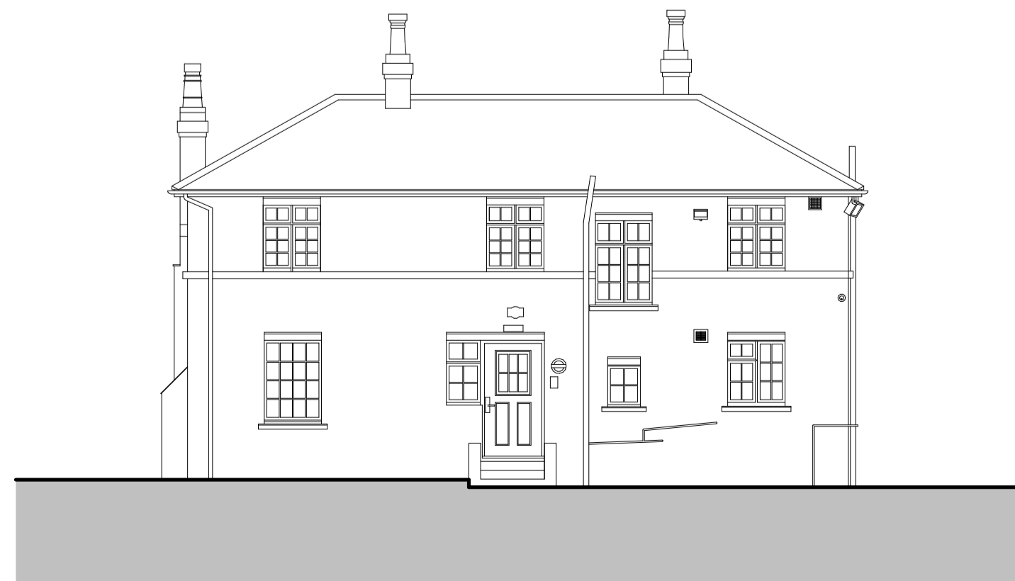
13 Upper Cottage North East Elevation - Proposed 1:100