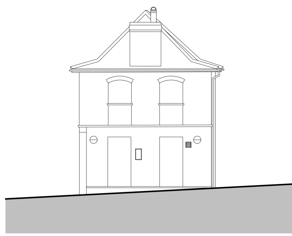
2 Lower Cottage North West Elevation - Existing 1:100