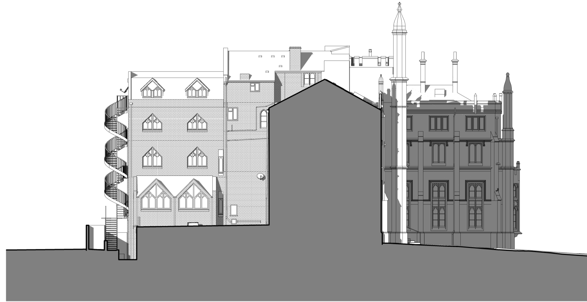
3 Main Building Section CC - Existing 1:200