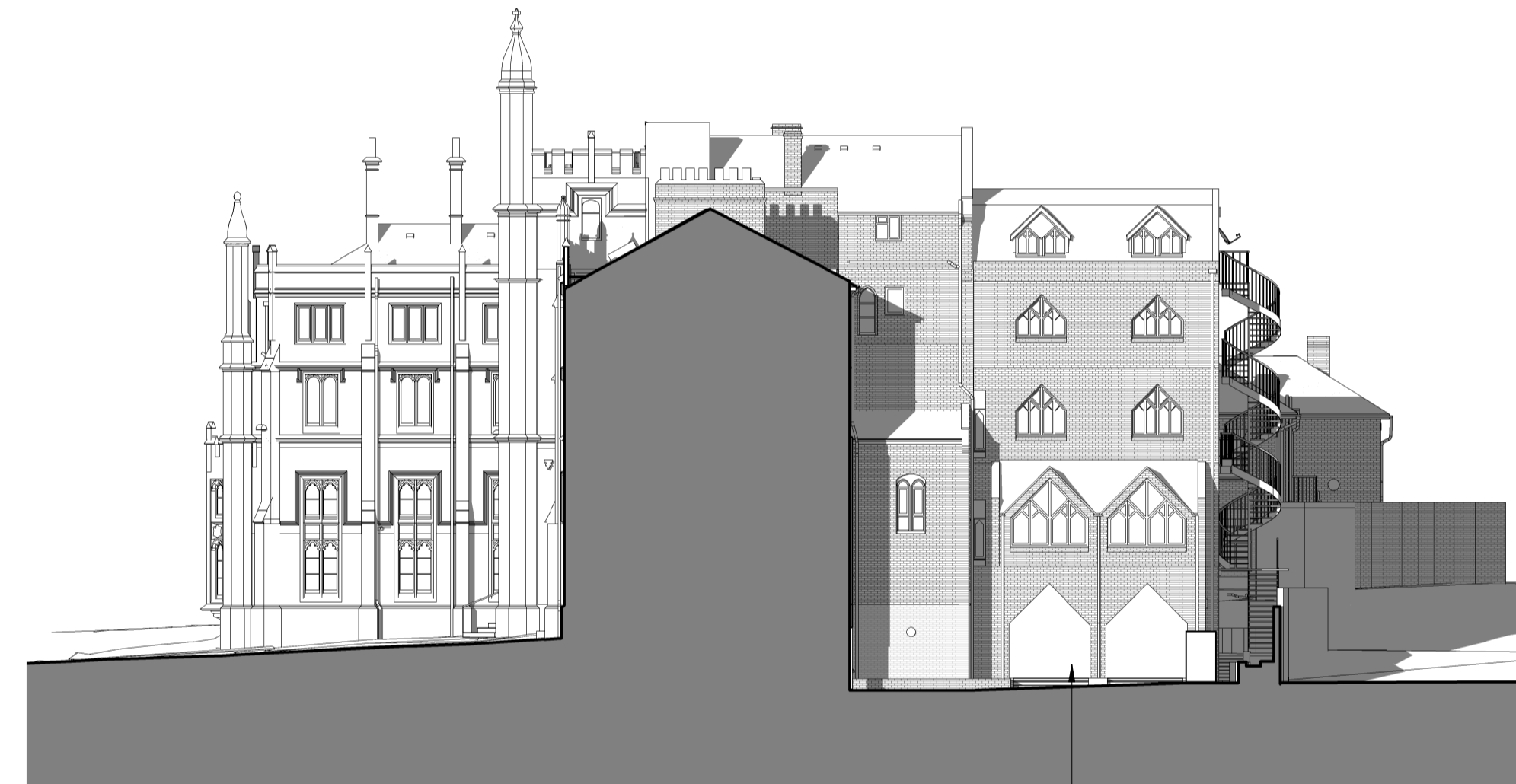
4 Main Building Section DD - Proposed 1:200

Single storey conservatory demolished, existing wall openings beyond to remain