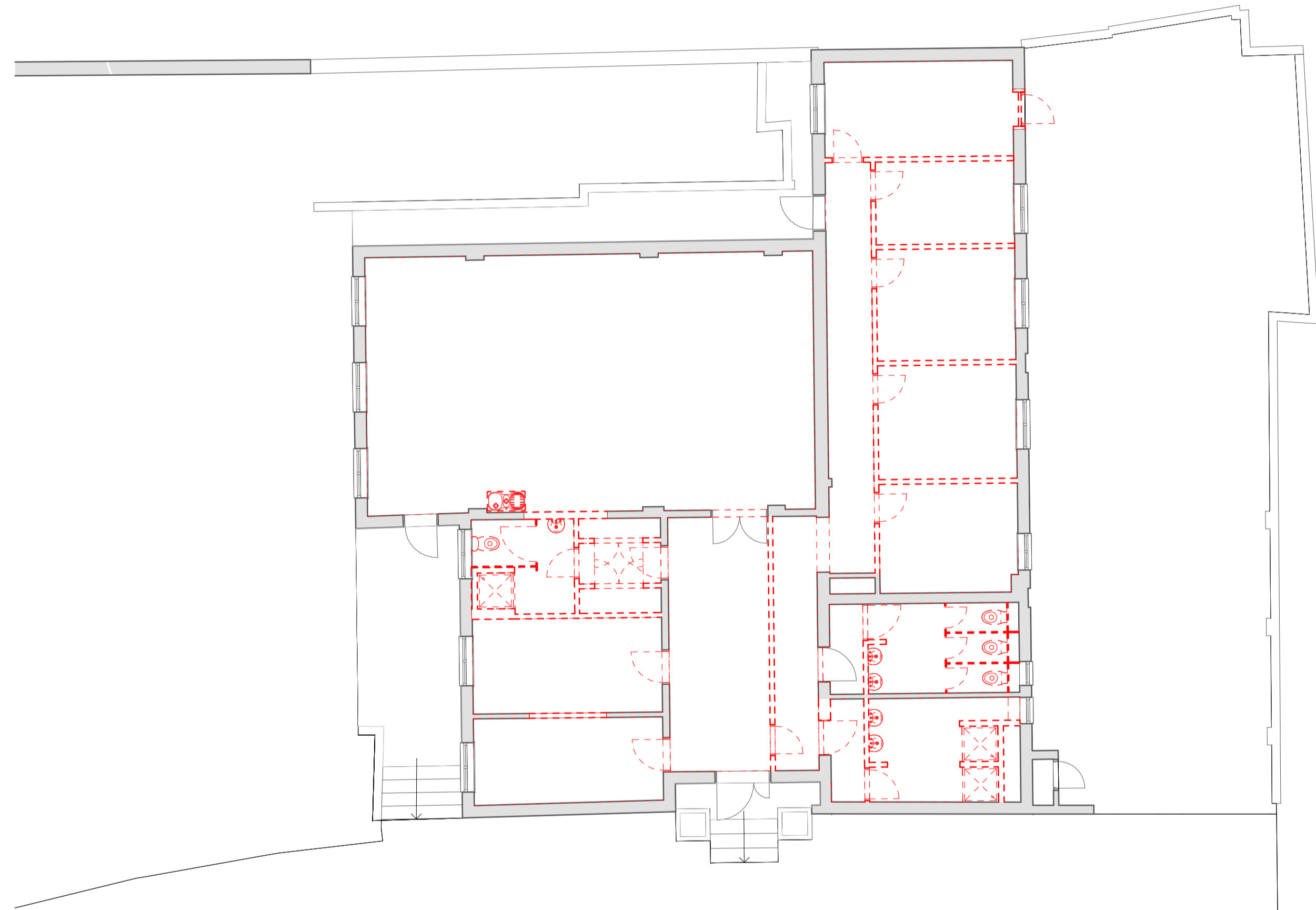
1 Longley House Ground Floor Plan - Existing 1:100