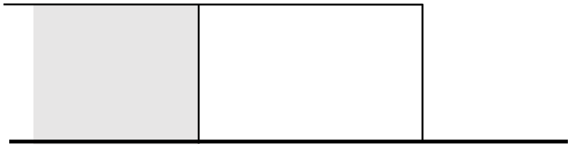
EXISTING EAST FACING ELEVATION REAR