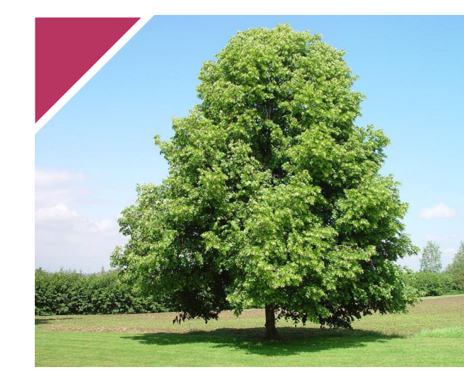
EG: TILIA CORDATA