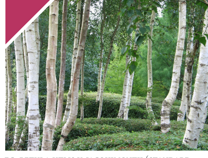
EG: BETULA UTLIS V. JACQUIMONTII (STANDARD & MULTI-STEM)