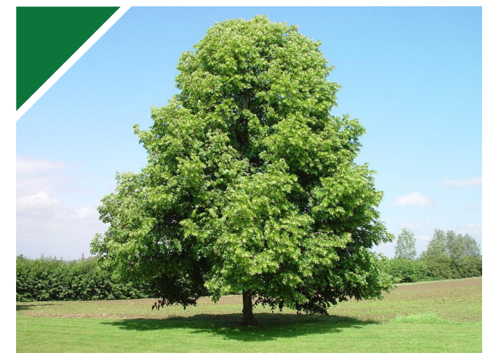
EG: TILIA CORDATA