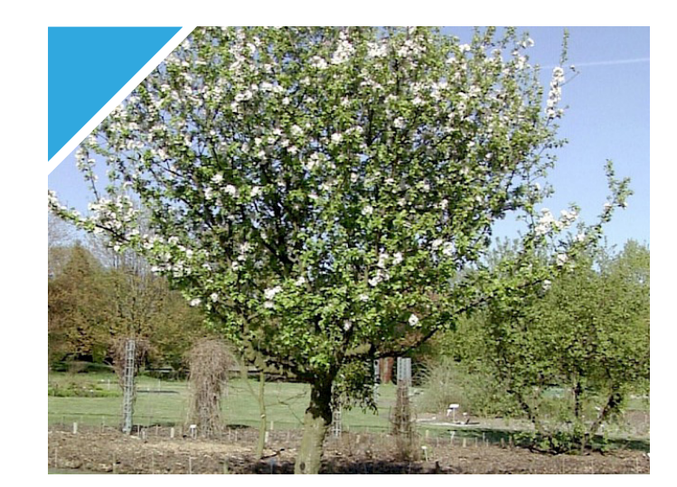
EG: MALUS SYLVESTRIS