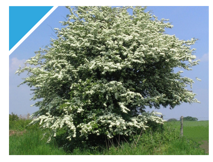
EG: CRATAEGUS MONOGYNA