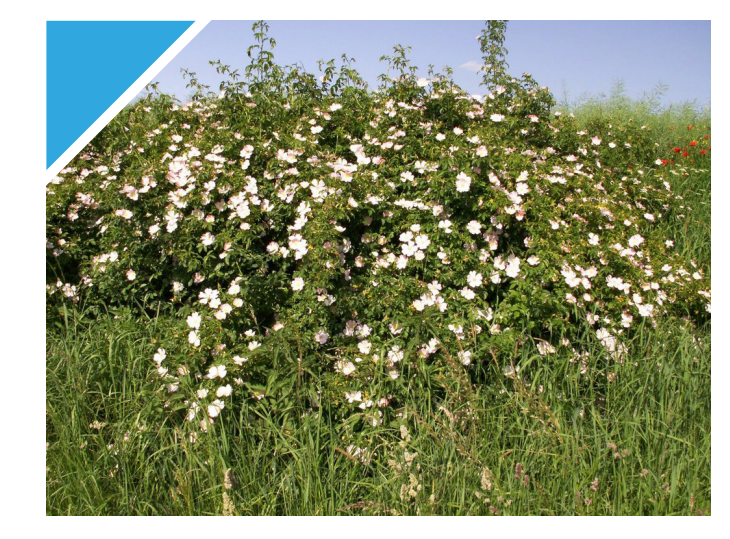
EG: ROSA CANINA