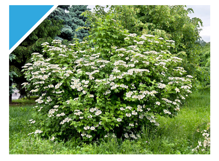
EG: VIBURNUM OPULUS