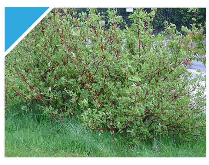
EG: CORNUS SANGUINEA