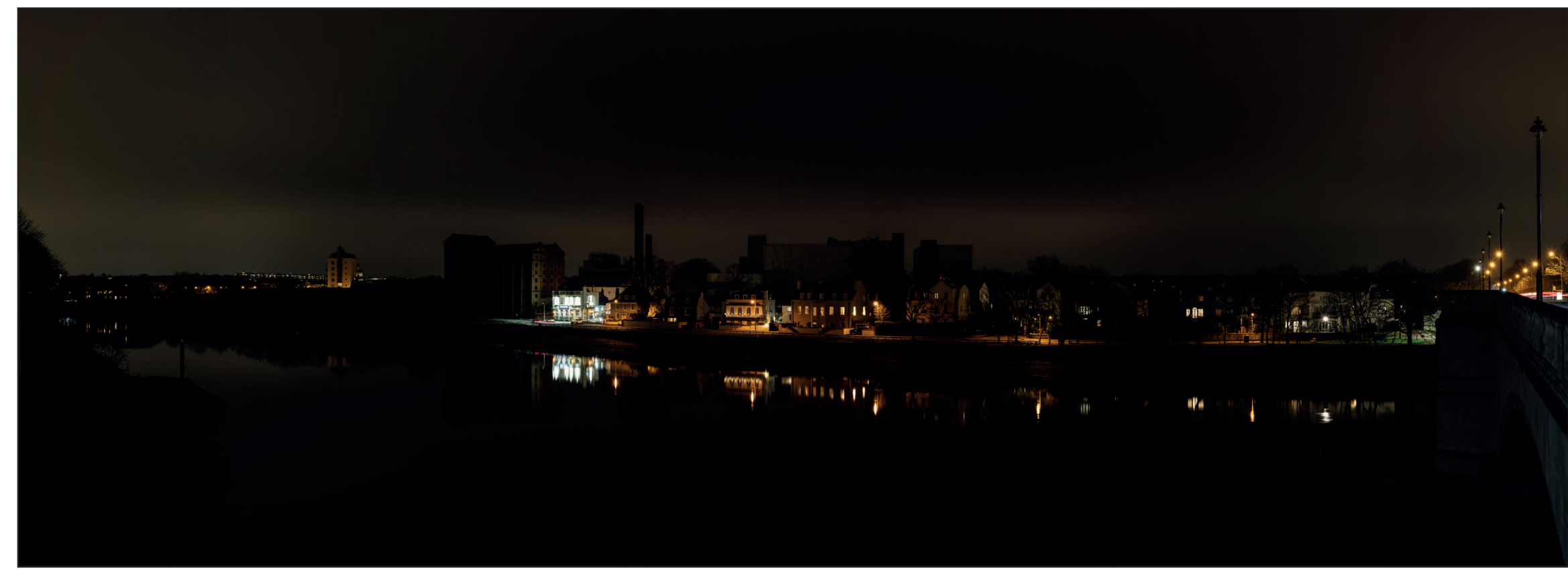
Viewpoint 4: Existing night-time view from the northern end of Chiswick Bridge across the River Thames, towards the Stag Brewery component of the Site