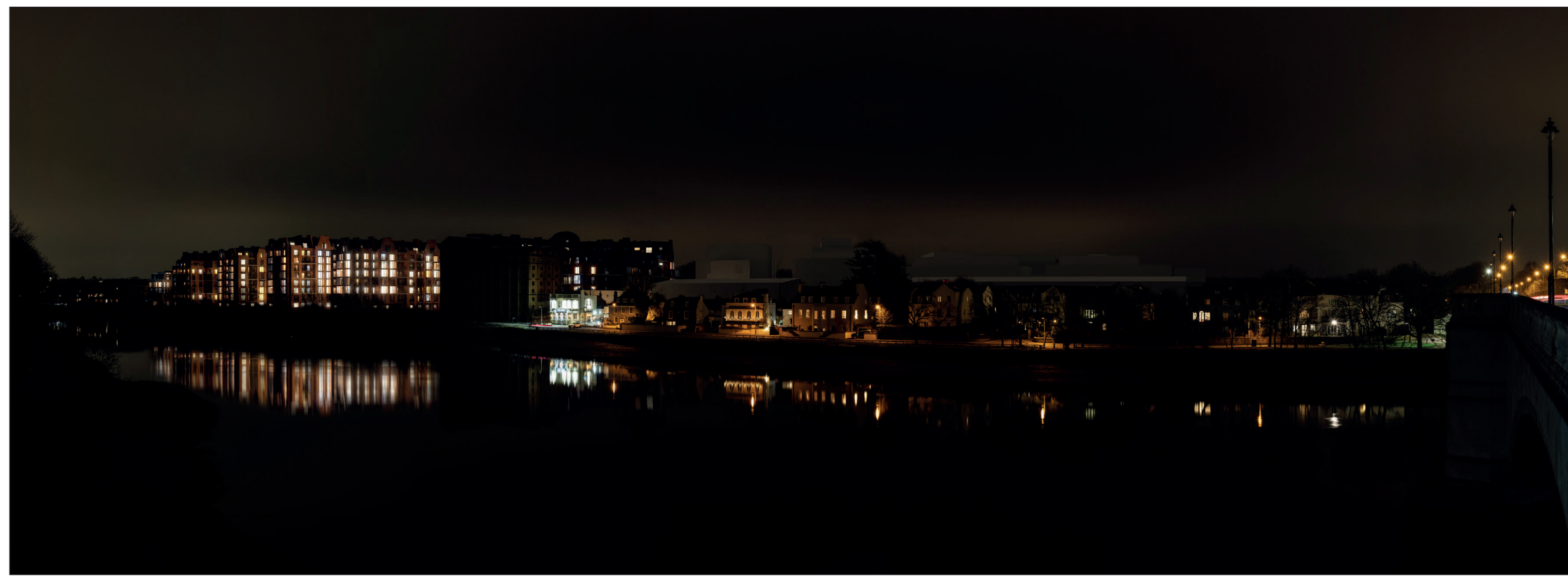
Viewpoint 4: Proposed night-time view from the northern end of Chiswick Bridge across the River Thames, towards the Stag Brewery component of the Site.