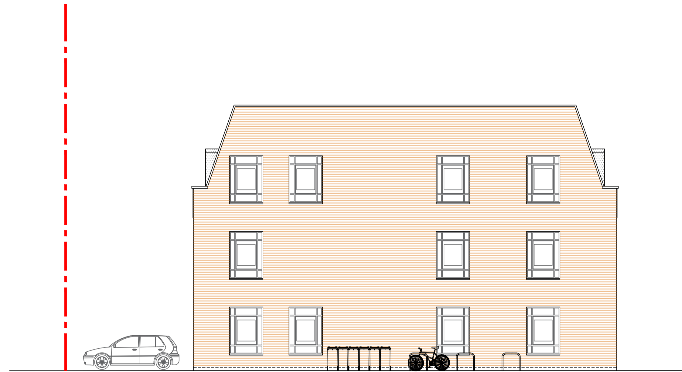
PROPOSED SIDE ELEVATION (FACING n° 35 CANDLER MEWS) 1:100