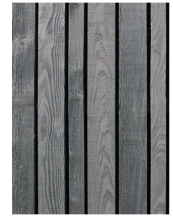
BLACK STAINED TIMBER