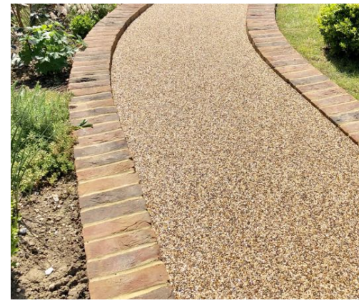
BRICK EDGED PERMEABLE RESIN BOUND GRAVEL