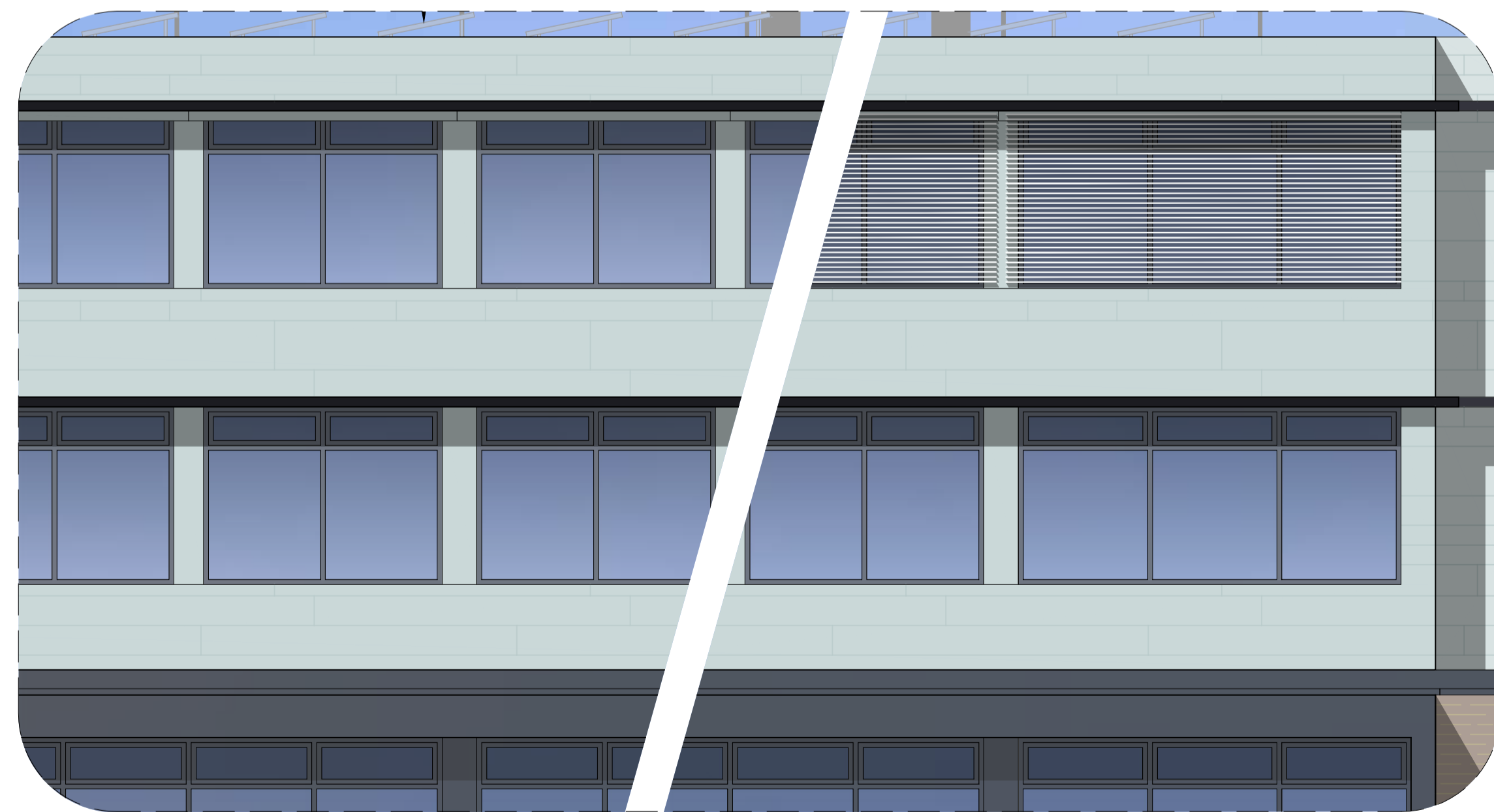
3 EXTRACT SHOWING BLINDS UP Vs DOWN 1 : 50