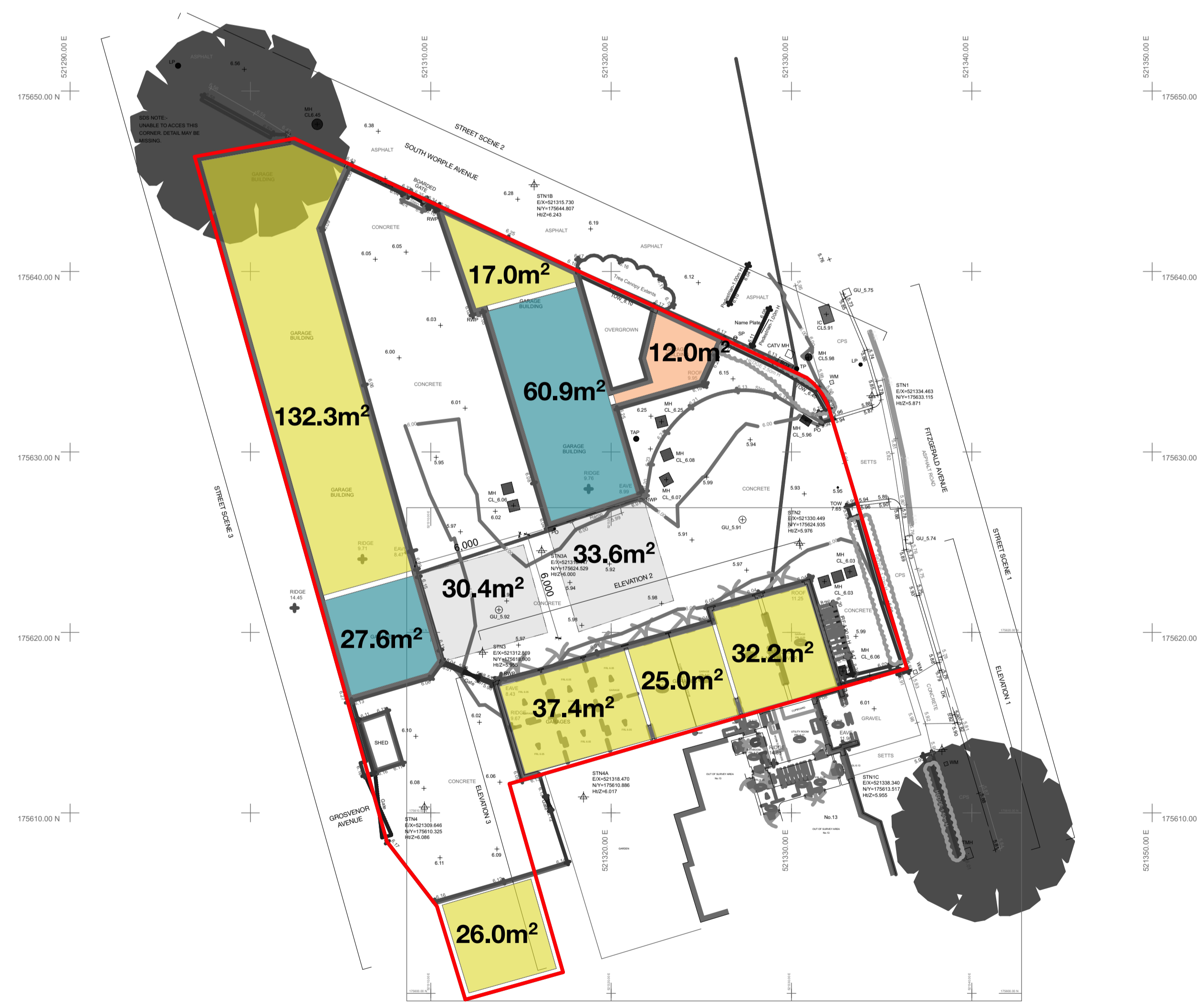
Existing Site Use First Floor