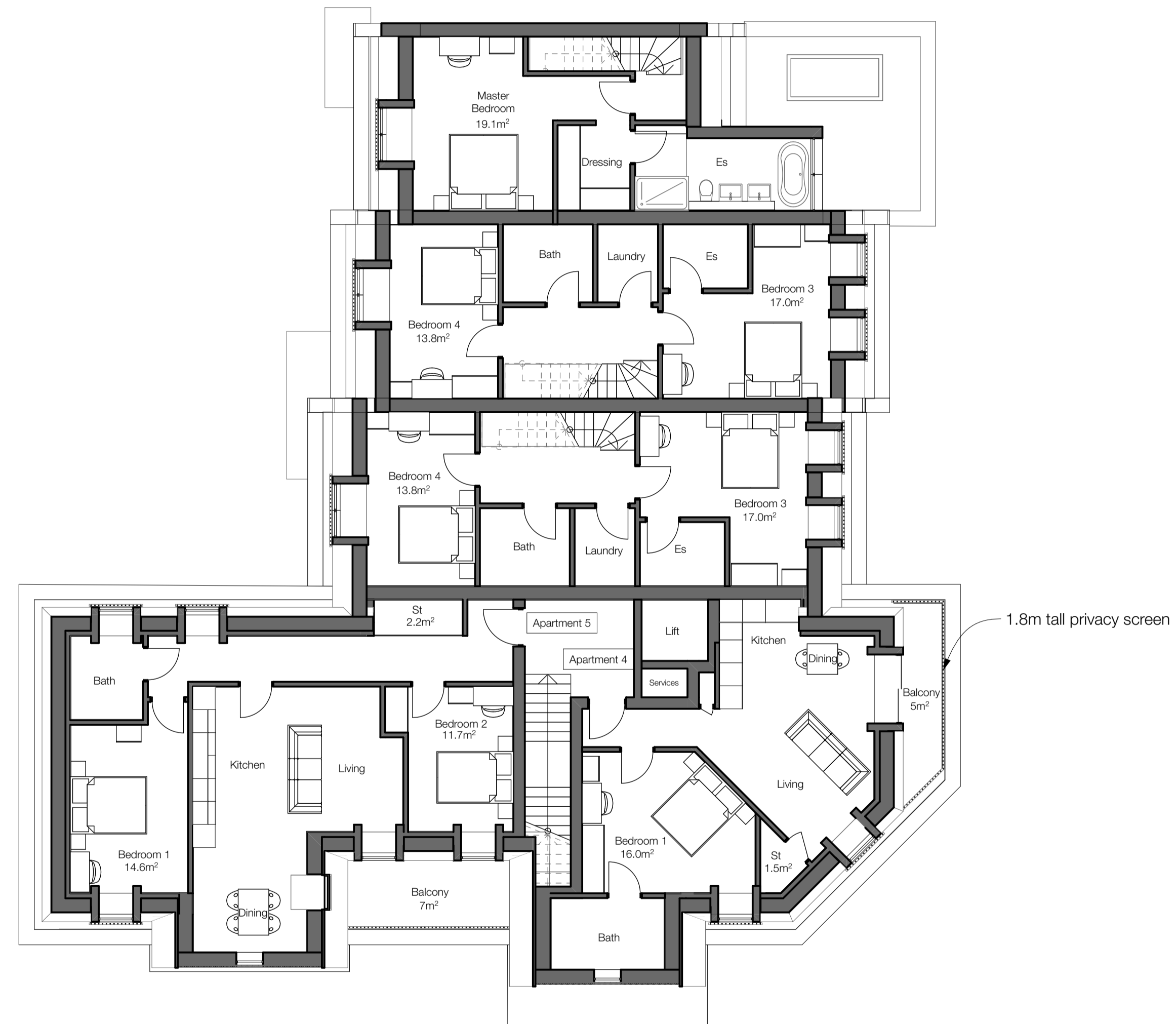
1 02-Second Floor