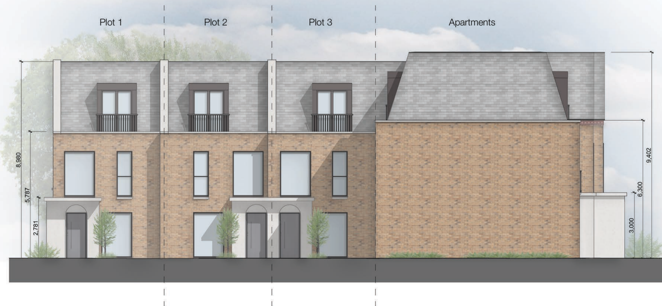
4 Elevation 4 (Sout-East)