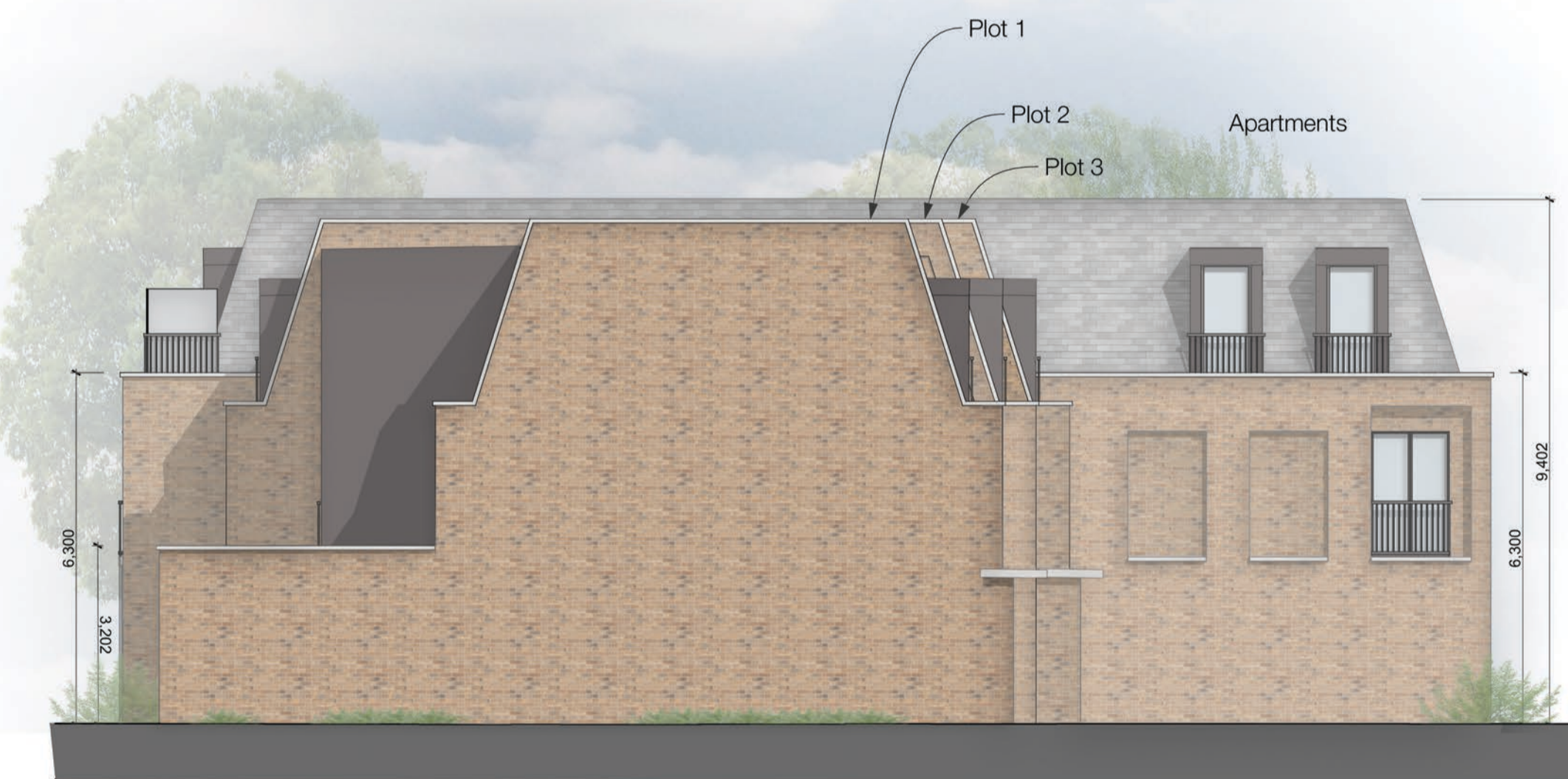
3 Elevation 3 (South-West)