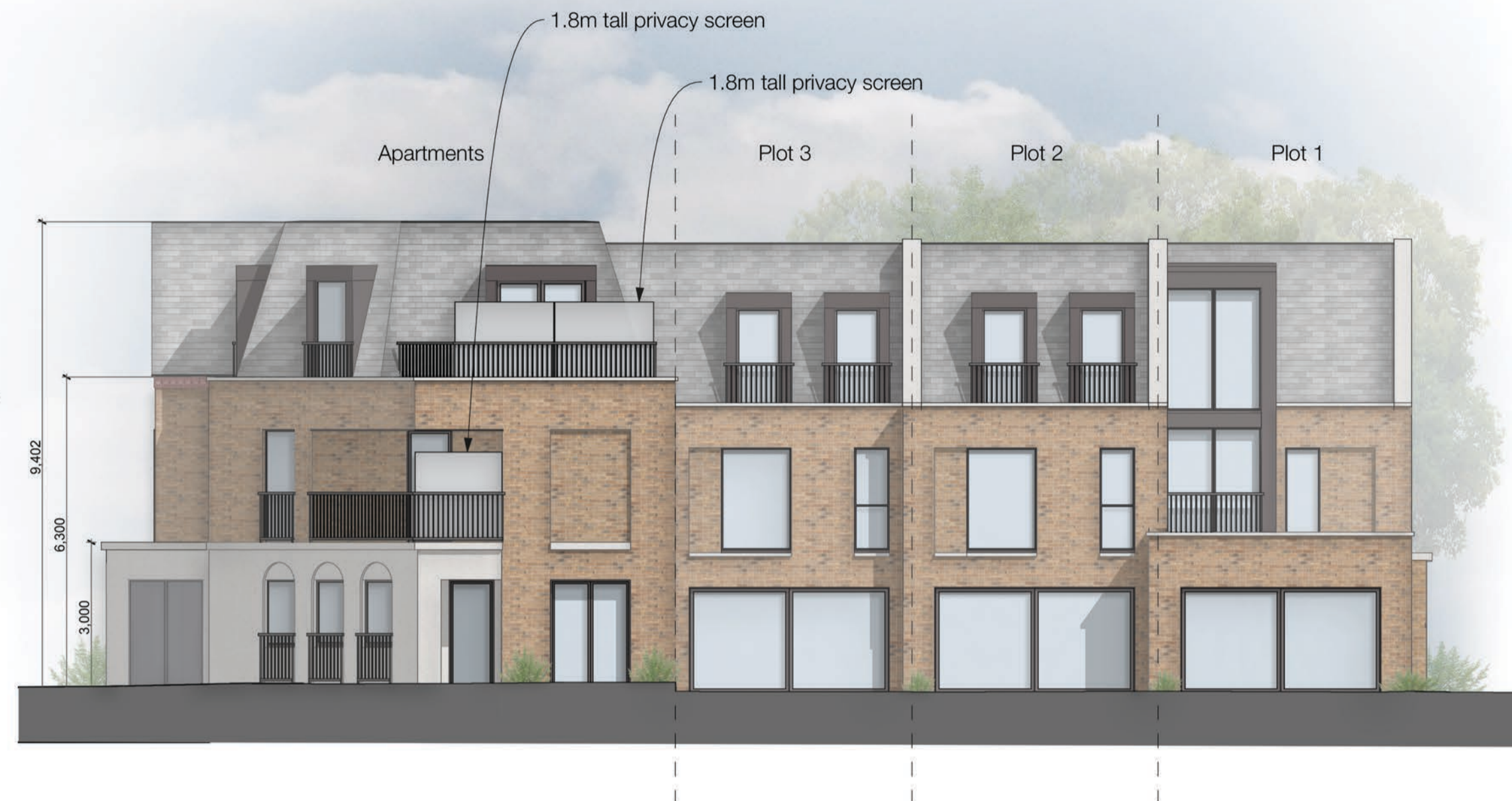
2 Elevation 2 (North-West)