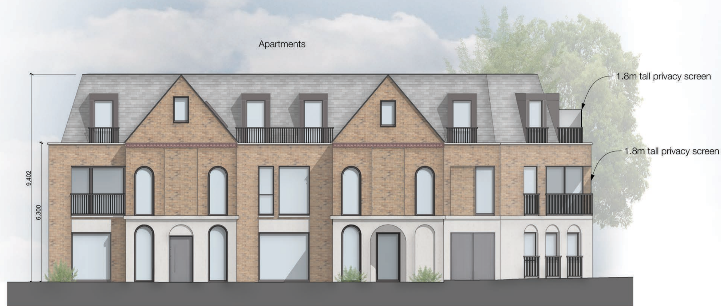
1 Elevation 1 (North-East)