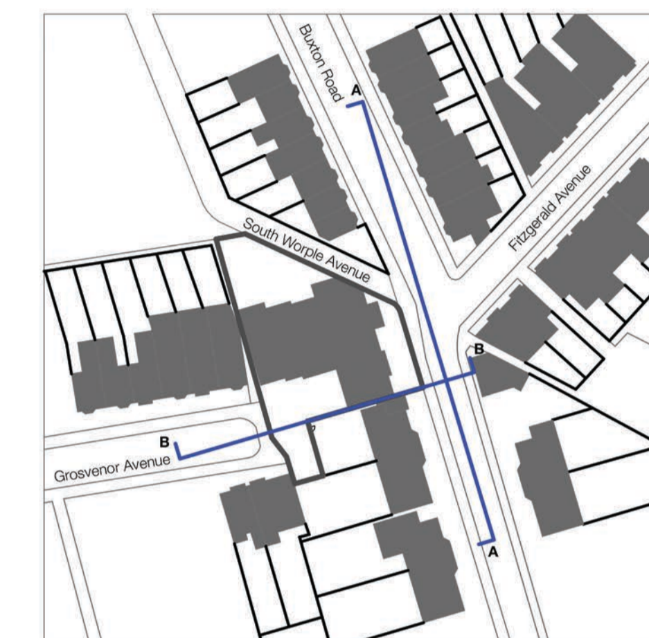
3 Reference Map (not to scale)