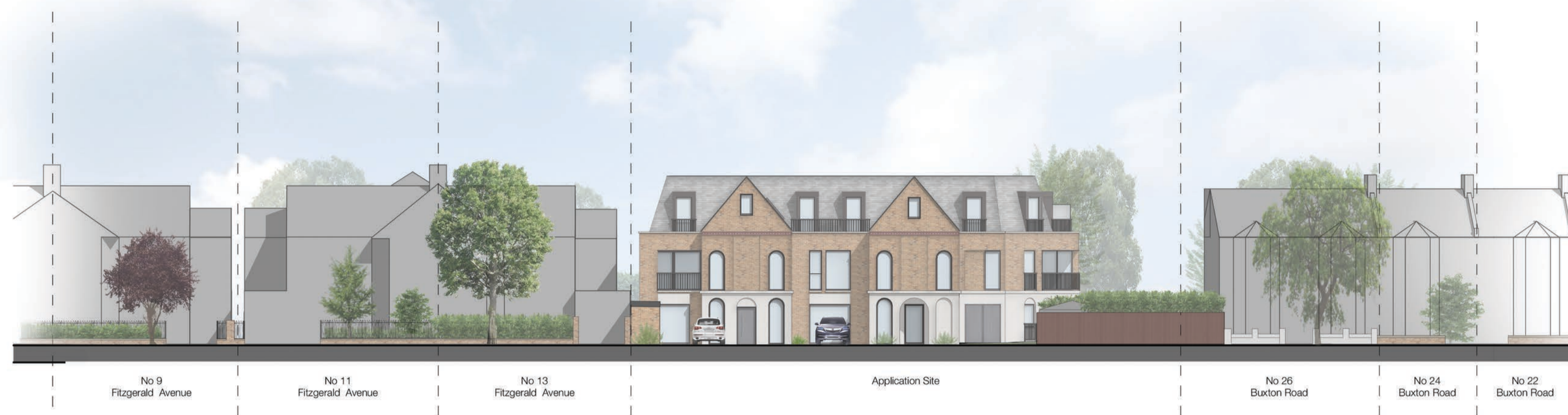
1 Street Scene A-A