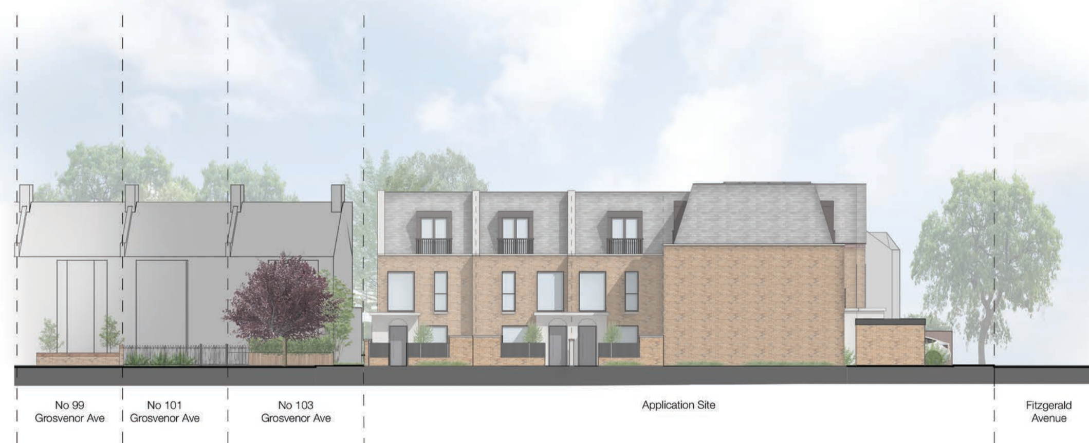
2 Street Scene B-B