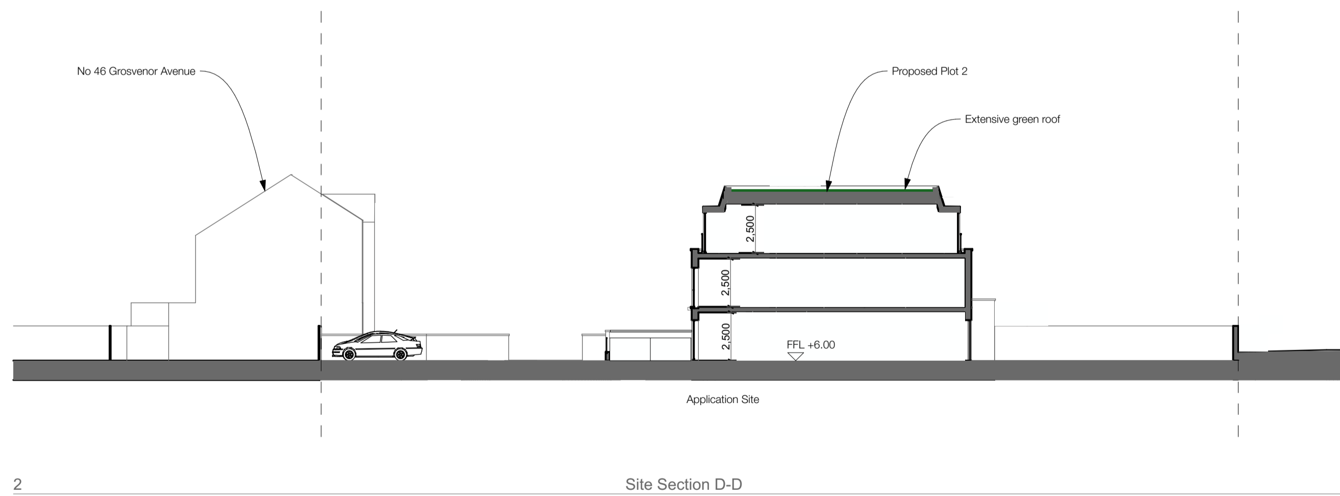
2 Site Section D-D