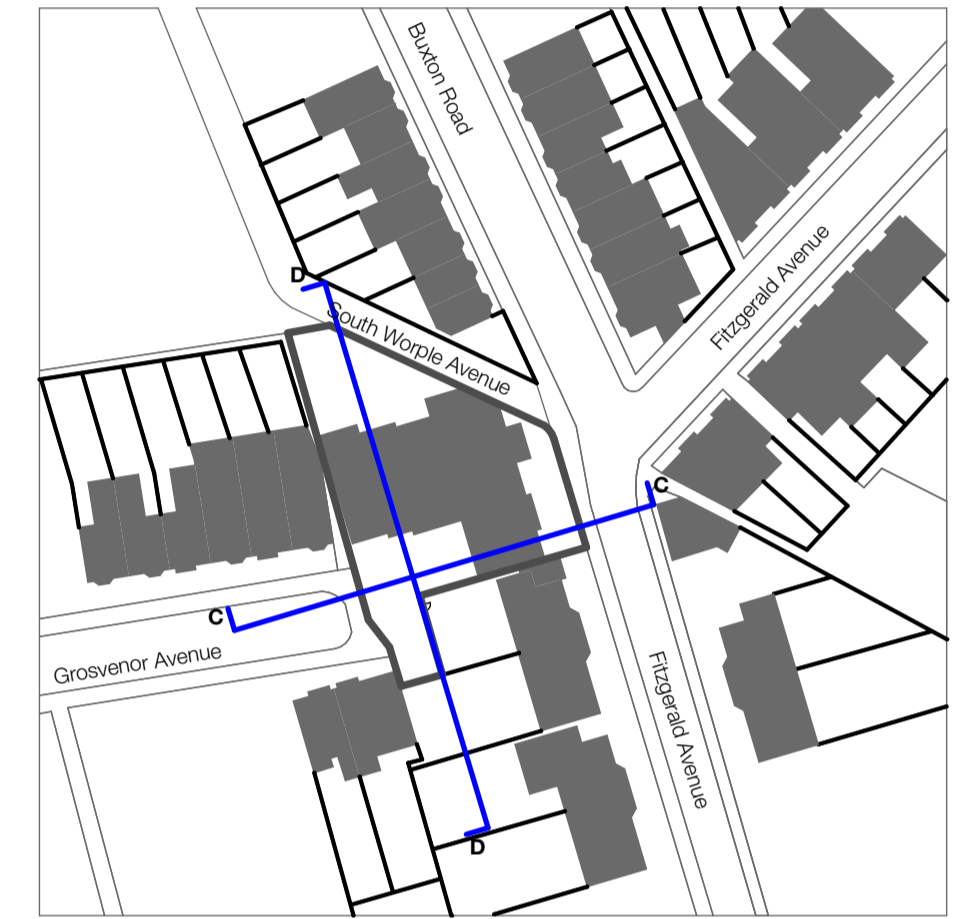
3 Reference Map (not to scale)