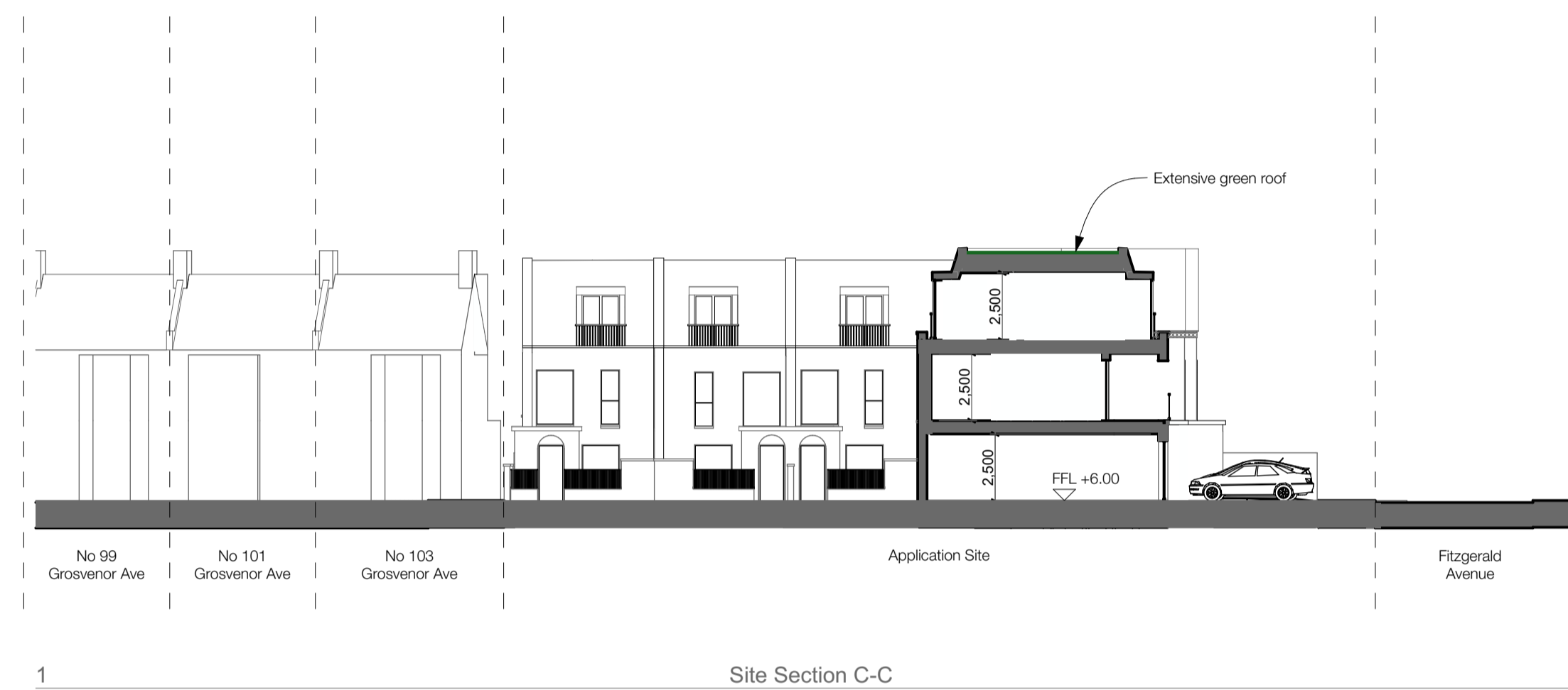
1 Site Section C-C