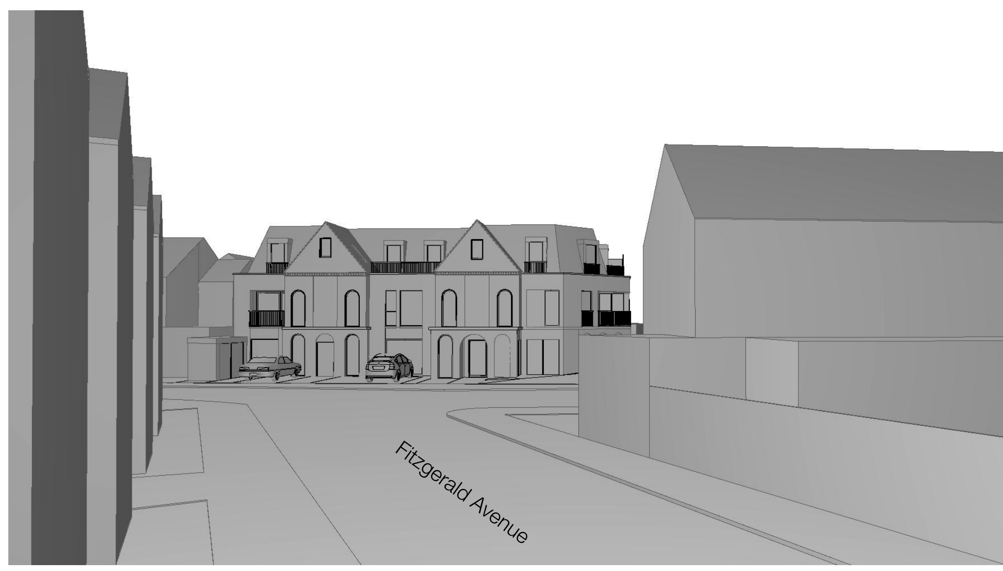
4 Generic Perspective