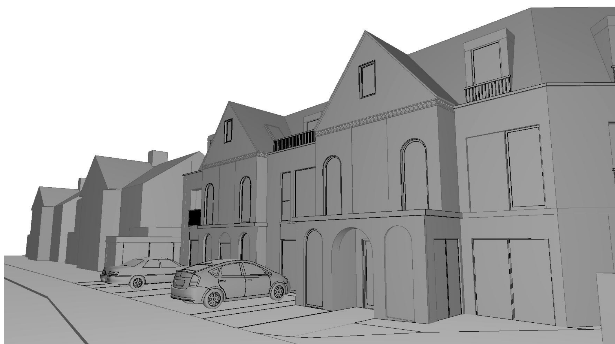
6 Generic Perspective