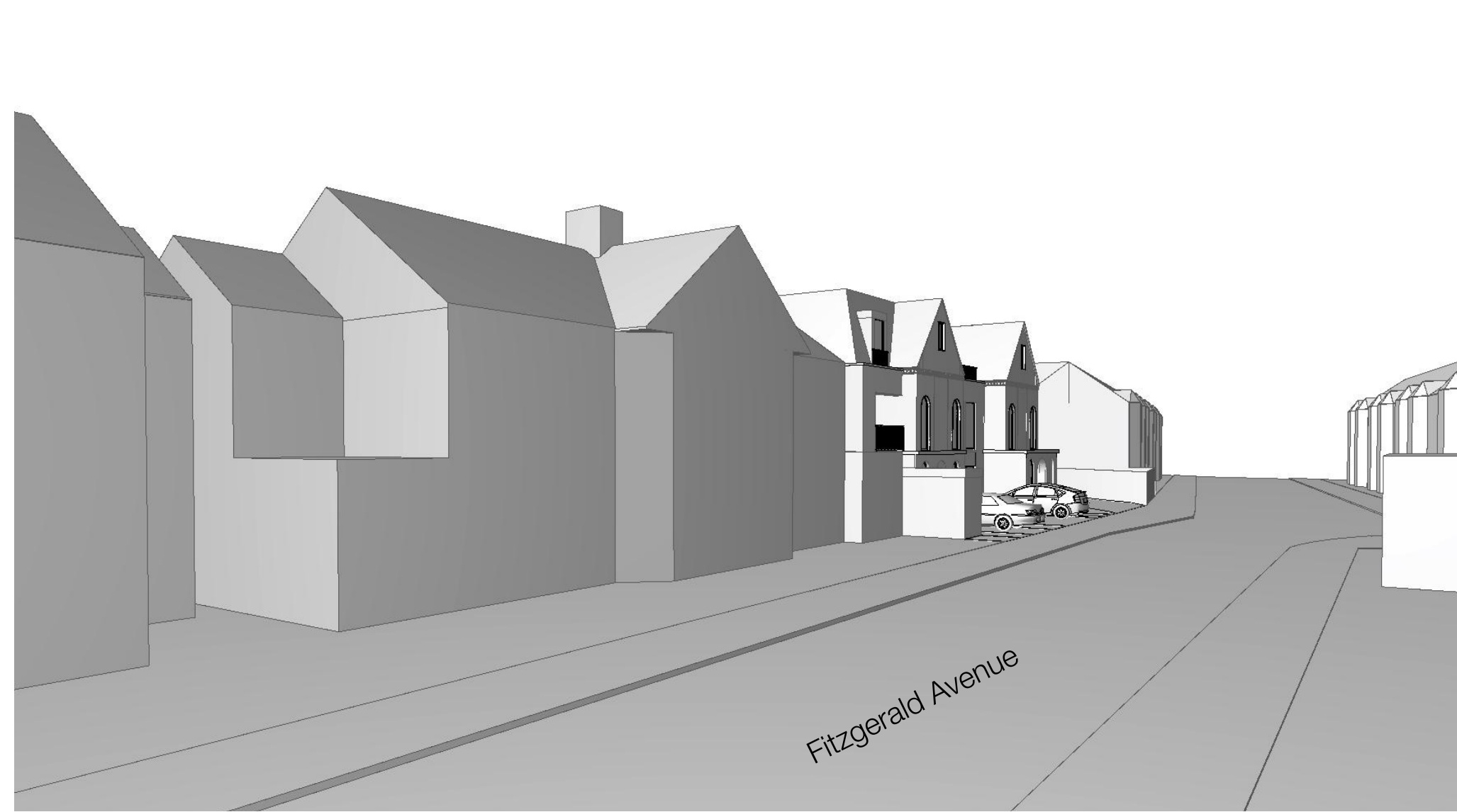
5 Generic Perspective