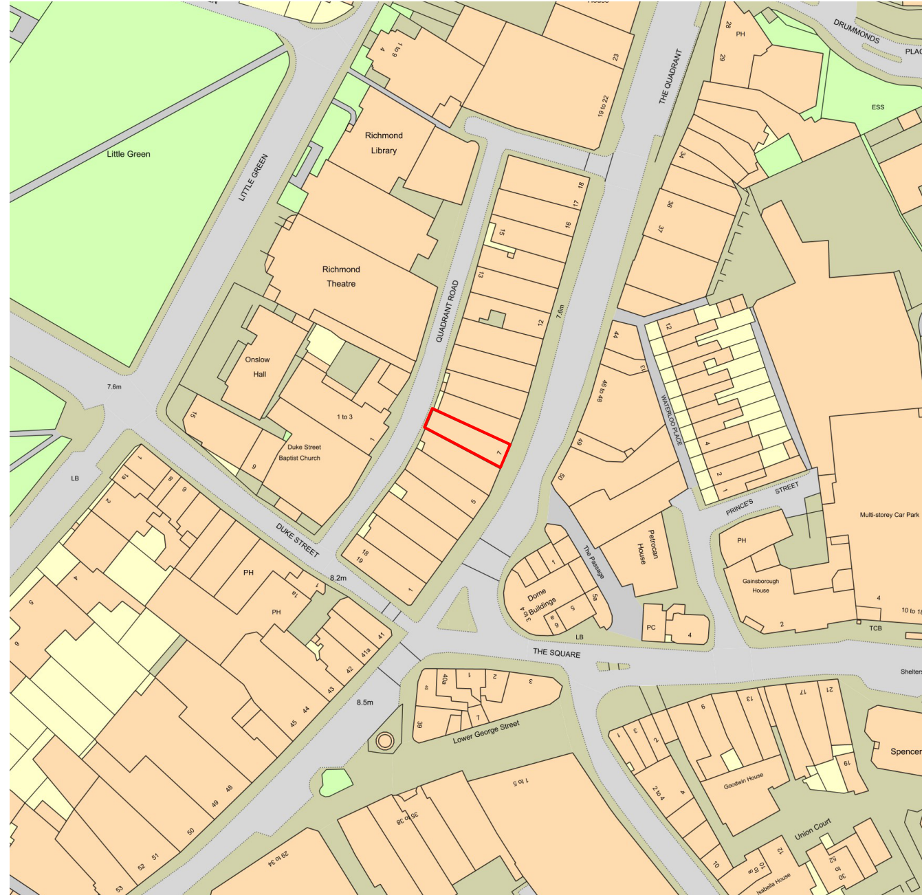
02 Existing Location Plan 1:1250