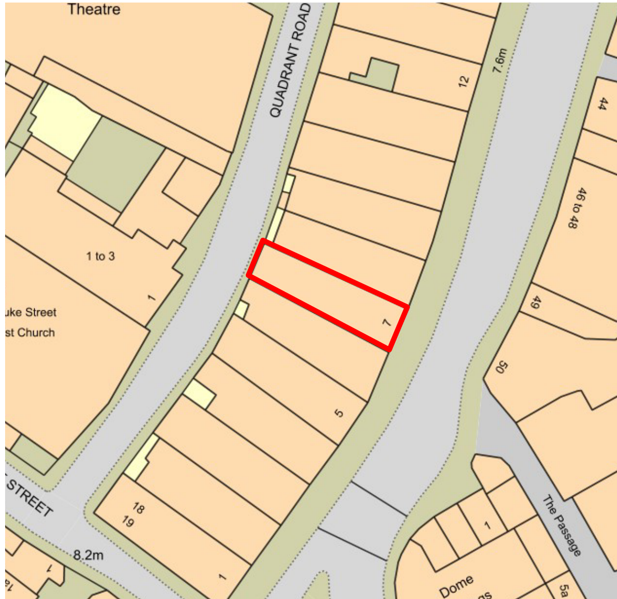
01 Existing Site Plan 1:500