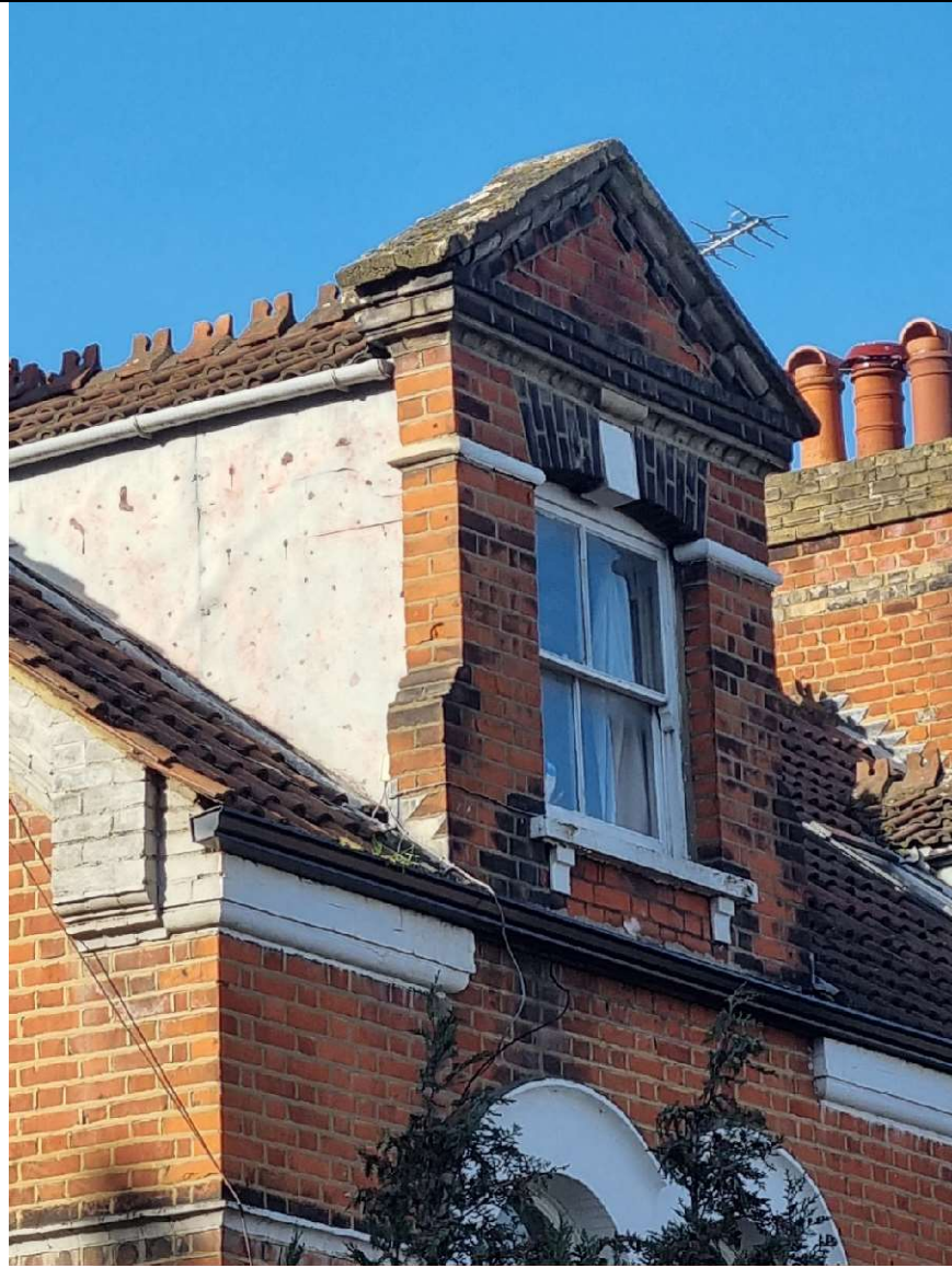
Stone corbel and string detail to be incorporated within the new proposal.