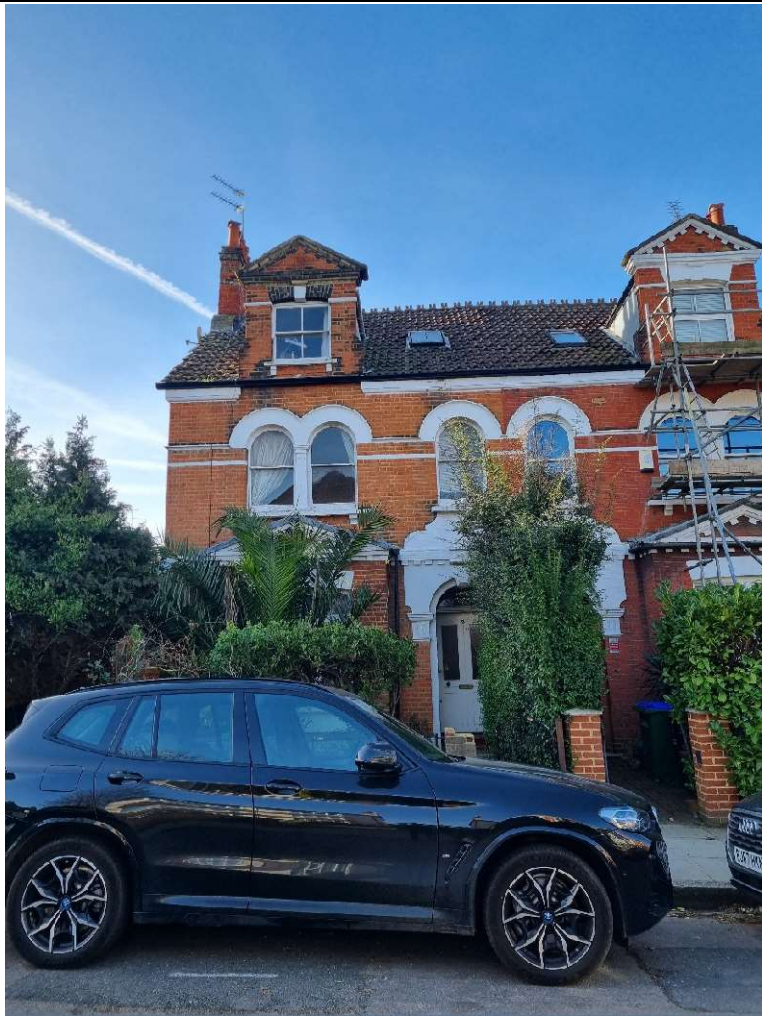
Front elevation view to East boundary from Sheen Park