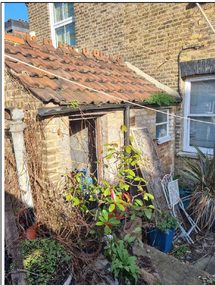
Existing out-building to be demolished.