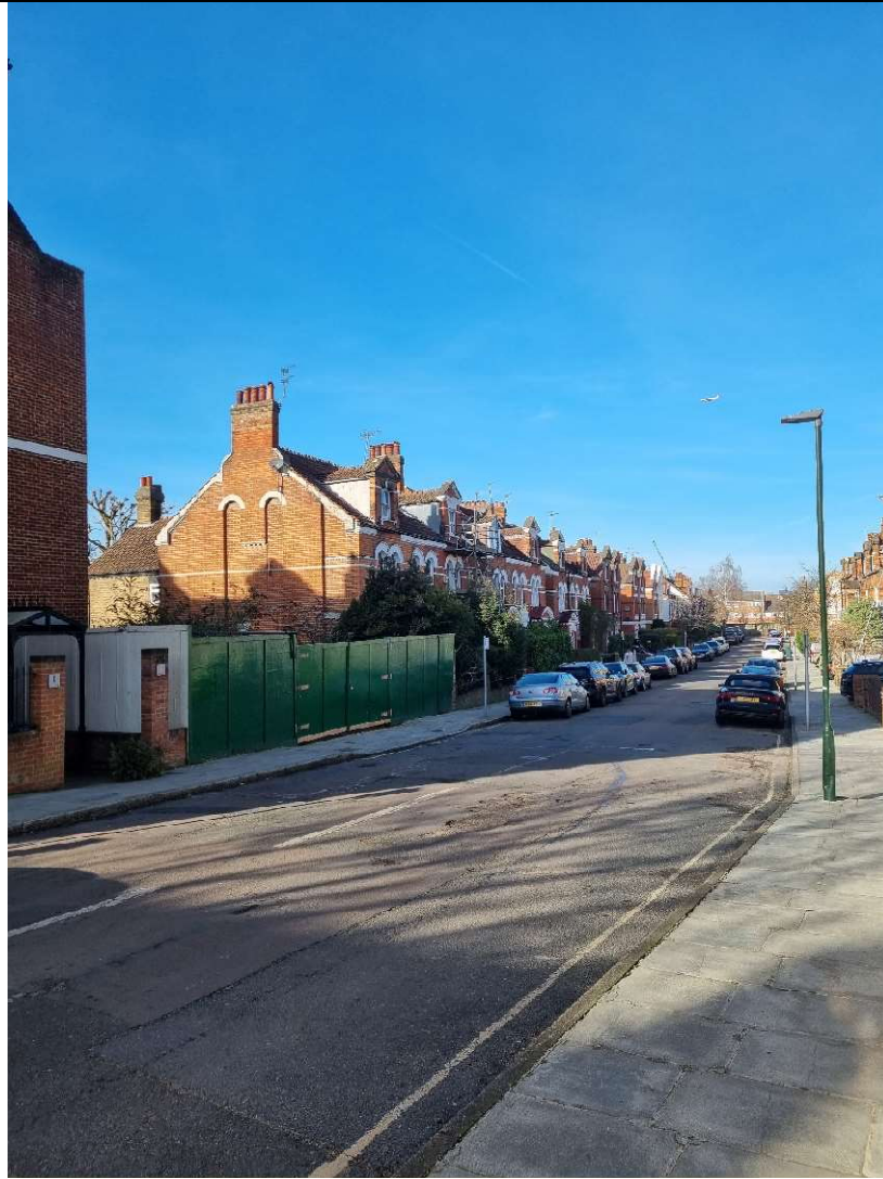
Side elevation view to South boundary from Sheen Park