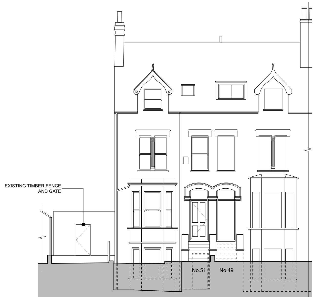
1 FRONT ELEVATION - EXISTING Scale 1:100@A3