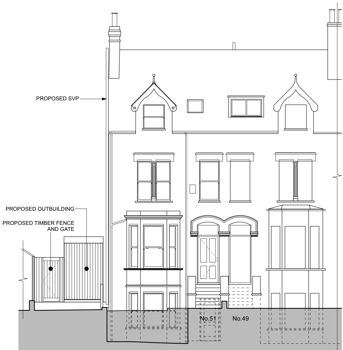
2 FRONT ELEVATION - PROPOSED Scale 1:100@A3