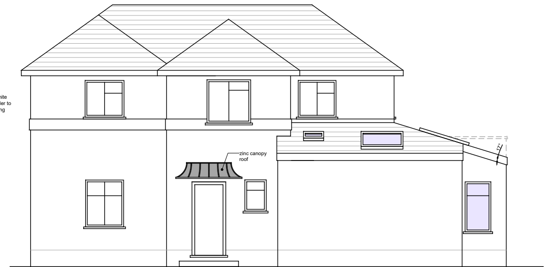
Proposed RHS Elevation

1 white in-fill existing ended if over existing gutter zinc canopy roof obscure glazed existing low level brickwork and foliage replaced with 2100mm high brickwork to match existing existing low level brickwork / fence panels replaced with 2100mm high brickwork to match existing wall screen for added privacy existing low level brickwork / fence panels replaced with 2100mm high brickwork to match existing wall screen for added privacy proposed white smooth render to match existing proposed white smooth render to match existing proposed RAL colour bi-fold windows to client request 3082 2970