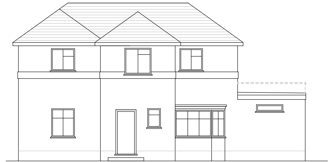
Existing RHS Elevation