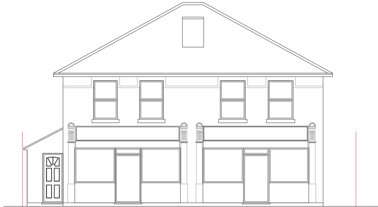
Existing Front Elevation Scale:1:100