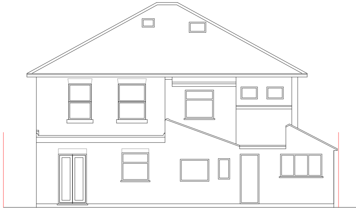
Existing Rear Elevation Scale:1:100