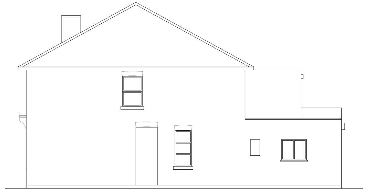
Existing Side Elevation Scale:1:100