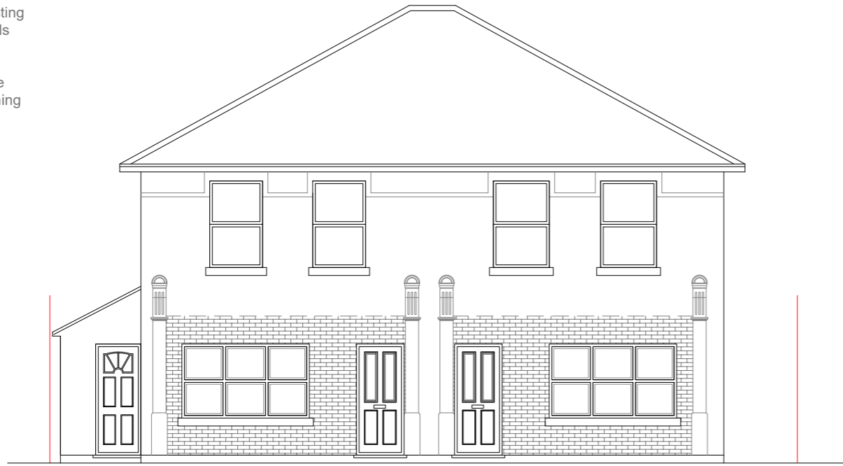
Proposed Front Elevation Scale:1:100

Proposed Flank Wall Window to be Obscure Glazed and Non Opening below 1.7m from FFL