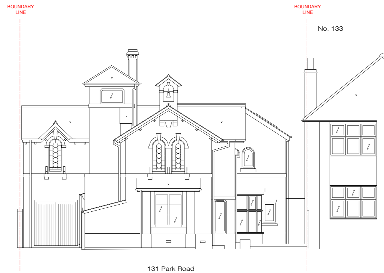
Existing South, Front Elevation 1:100