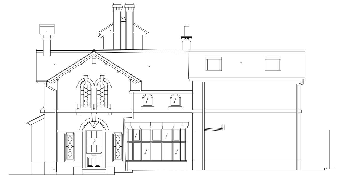
Existing East, Side Elevation 1:100