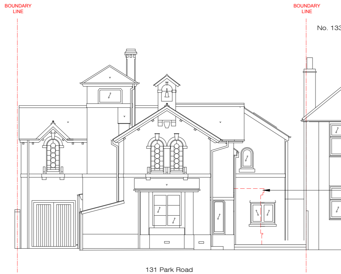
Proposed South, Front Elevation 1:100