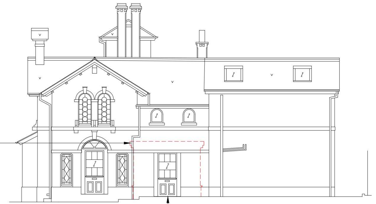
Proposed East, Side Elevation 1:100

outline of existing ground floor 1970s extension to be removed