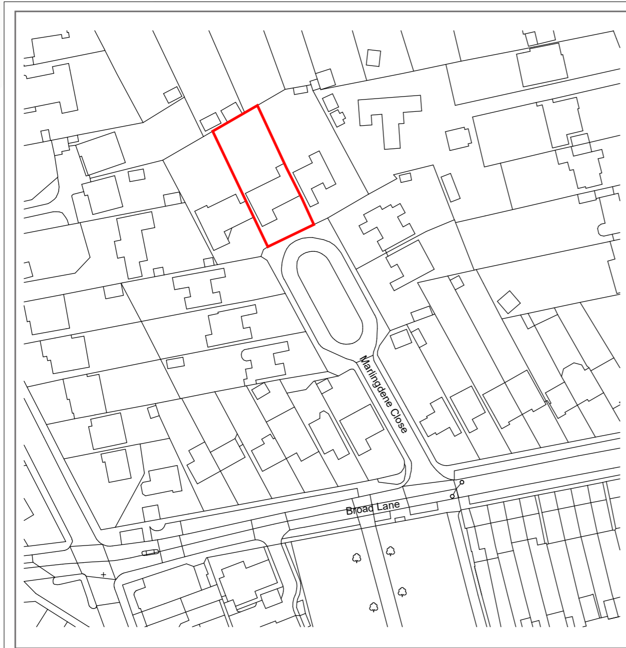
Existing Location Plan (1:1250)