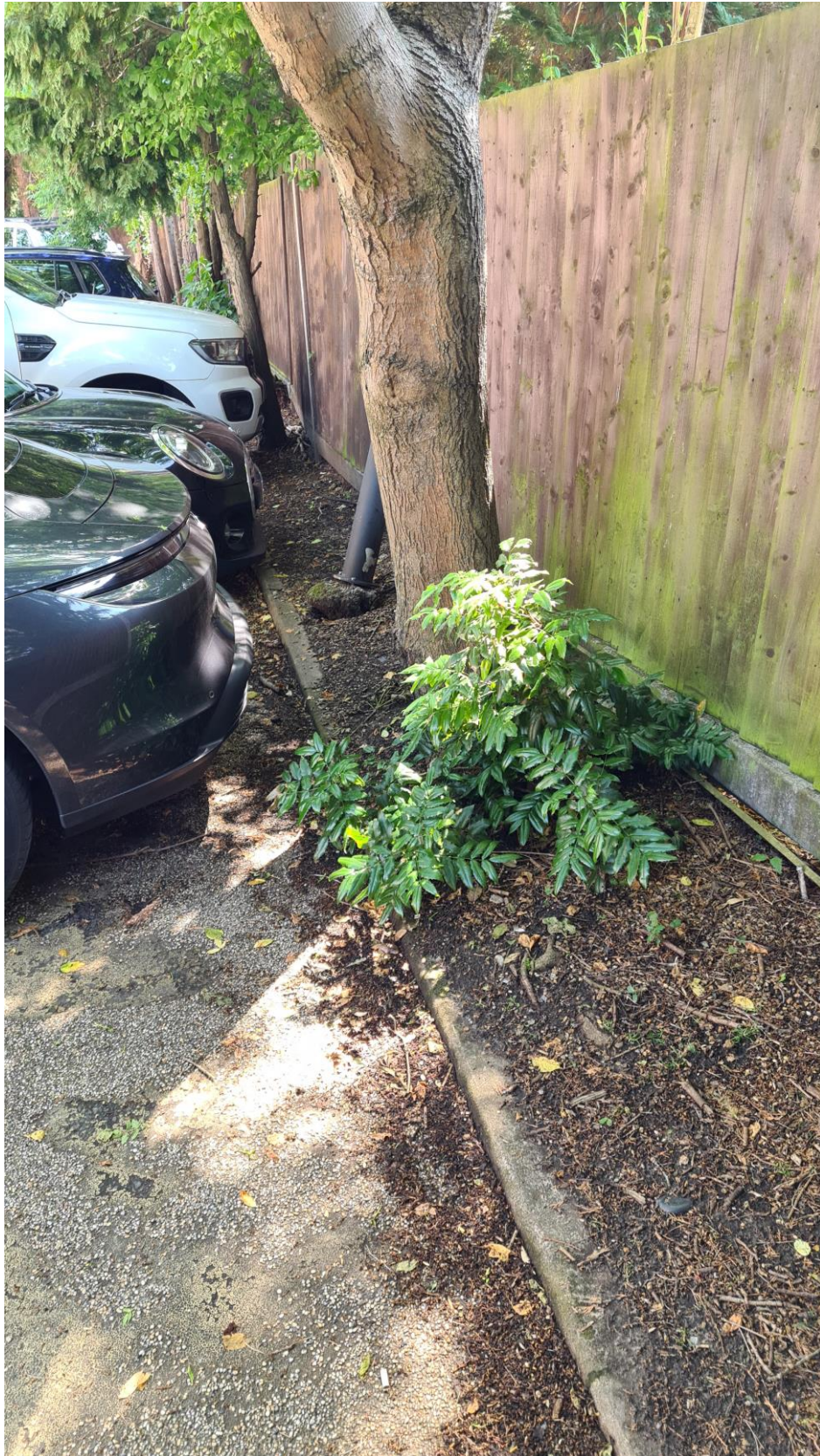
Fig. 05 - Two damaged existing bollards to be replaced with new bollards as show in Fig.06.