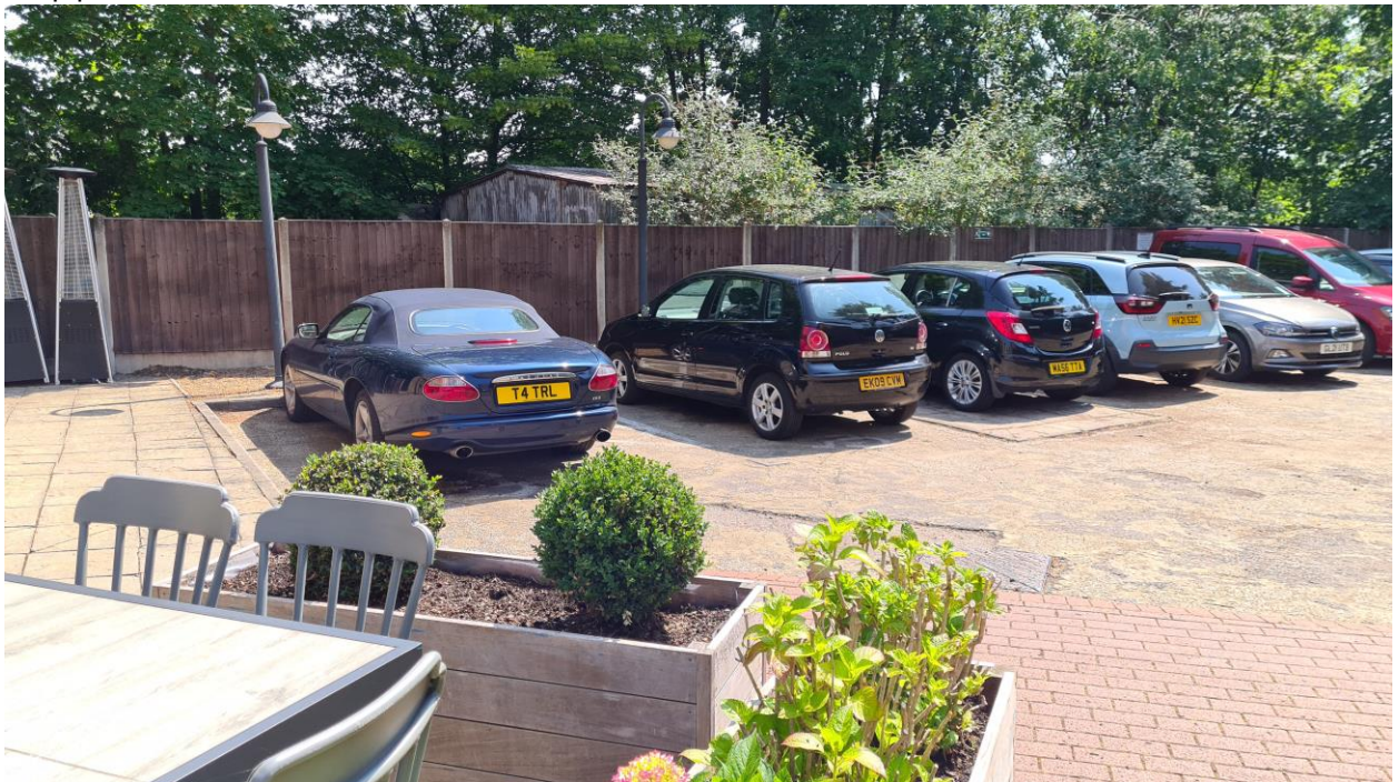
Fig. 02 – Existing lamppost over proposed disabled parking bays to remain.