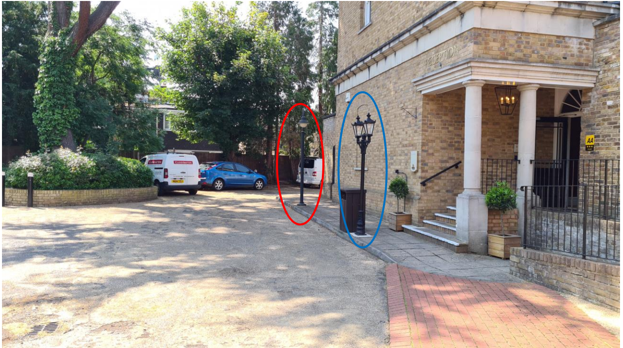
Fig. 01 – Lamp post highlighted in red to be repositioned to the proposed EVC bay and replaced with lamp post to match that circled in blue.