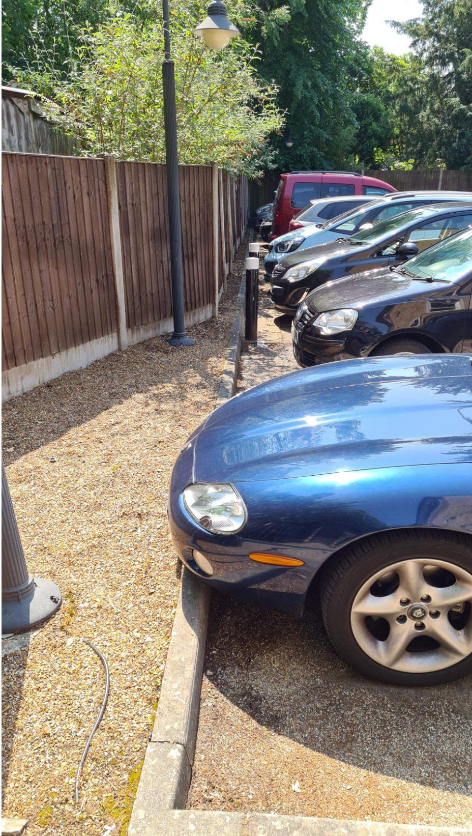
Fig. 03 – Existing lamp posts to remain.