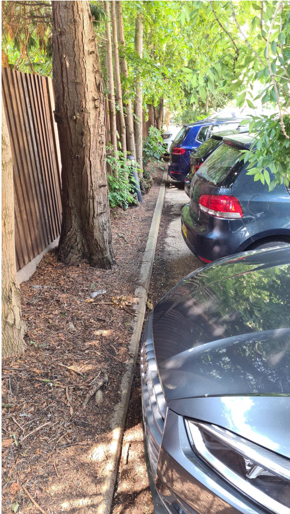
Fig.04 – Two damaged existing bollards to be replaced with new bollards as show in Fig.06.