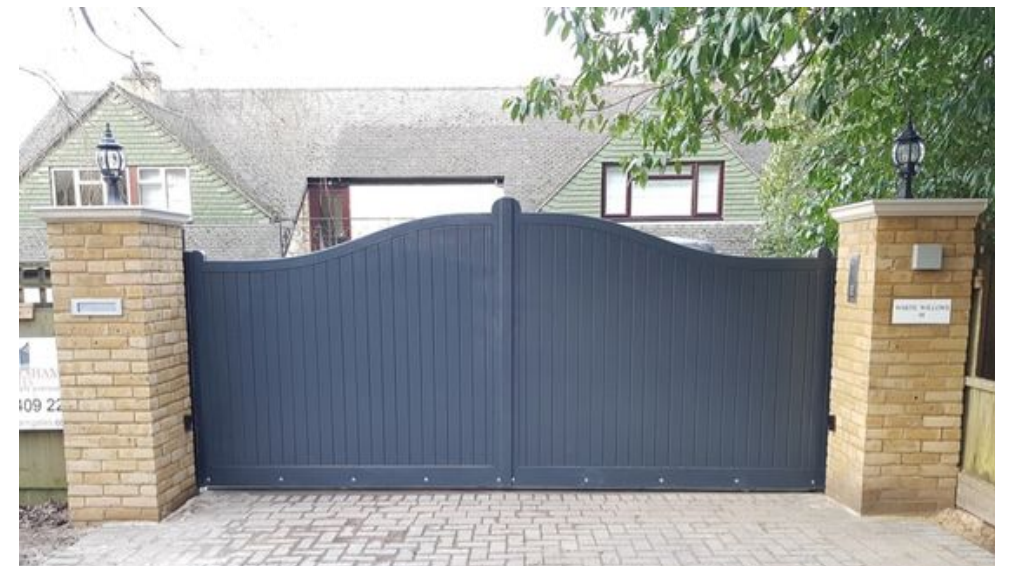
2 Image A Scale: n/a