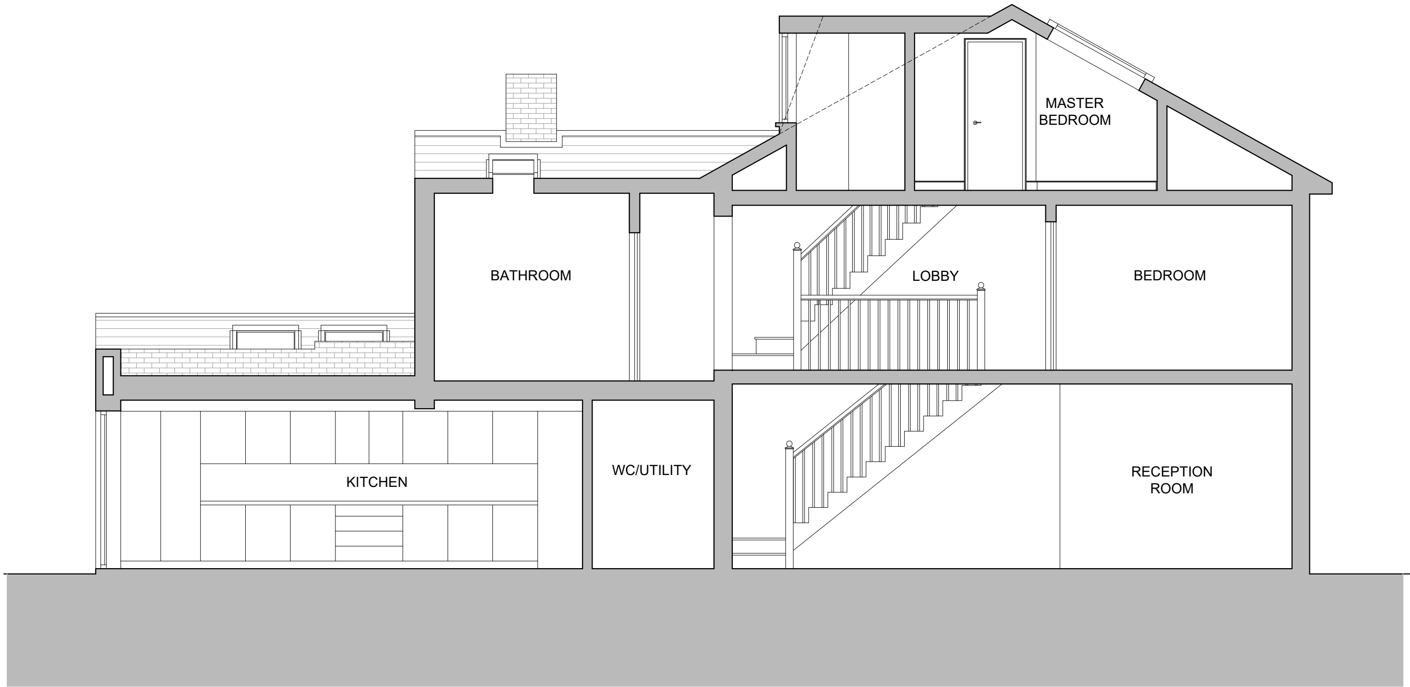
Proposed Section S-01 Scale 1:50 @A3