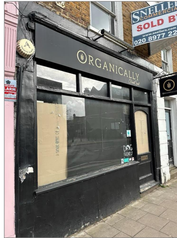
ORIGINAL FRONT ELEVATION SITE PICTURE

THIS DRAWING AND ALL THE INFORMATION CONTAINED HEREIN, COMPLETE WITH THE DESIGN CONCEPT AND INTENT, IS PROTECTED BY COPYRIGHT AND IS THE PROPERTY OF ZD DESIGN LTD. ANY REPRODUCTION OR USE OF THIS DRAWING OR INFORMATION WITHOUT THE WRITTEN APPROVAL OF ZD DESIGN LTD. IS STRICTLY PROHIBITED. ALL MEASUREMENTS ARE IN MILLIMETERS UNLESS OTHERWISE SPECIFIED. IT IS THE CONTRACTOR'S RESPONSIBILITY TO CHECK THE DRAWINGS AND ANY DESIGN DETAIL FOR THE INTENDED RESULTS.