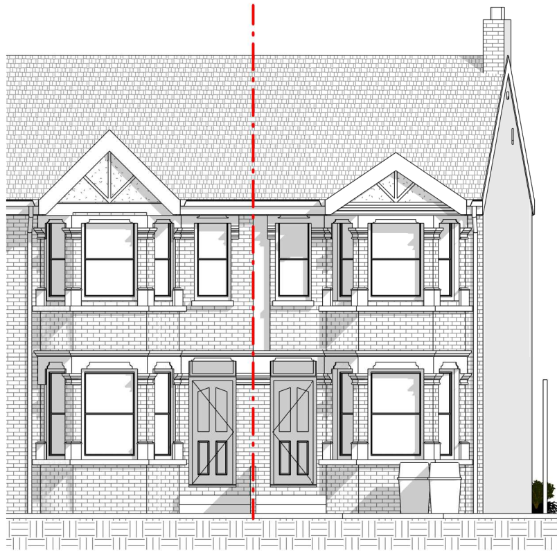
1 Proposed Front Elevation