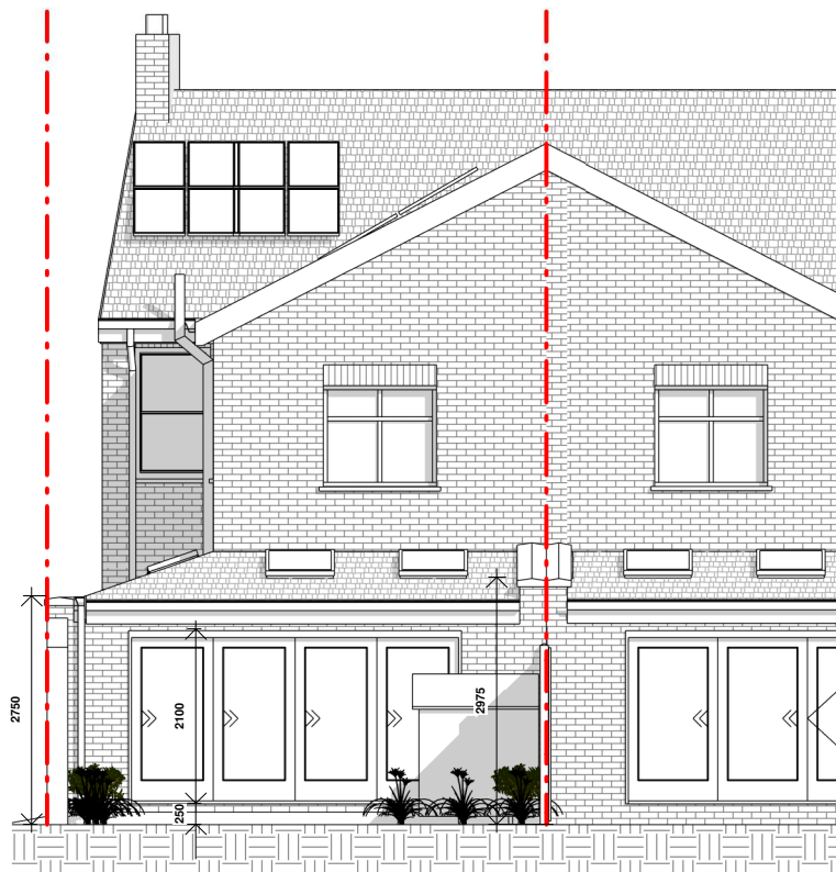
2 Proposed Rear Elevation