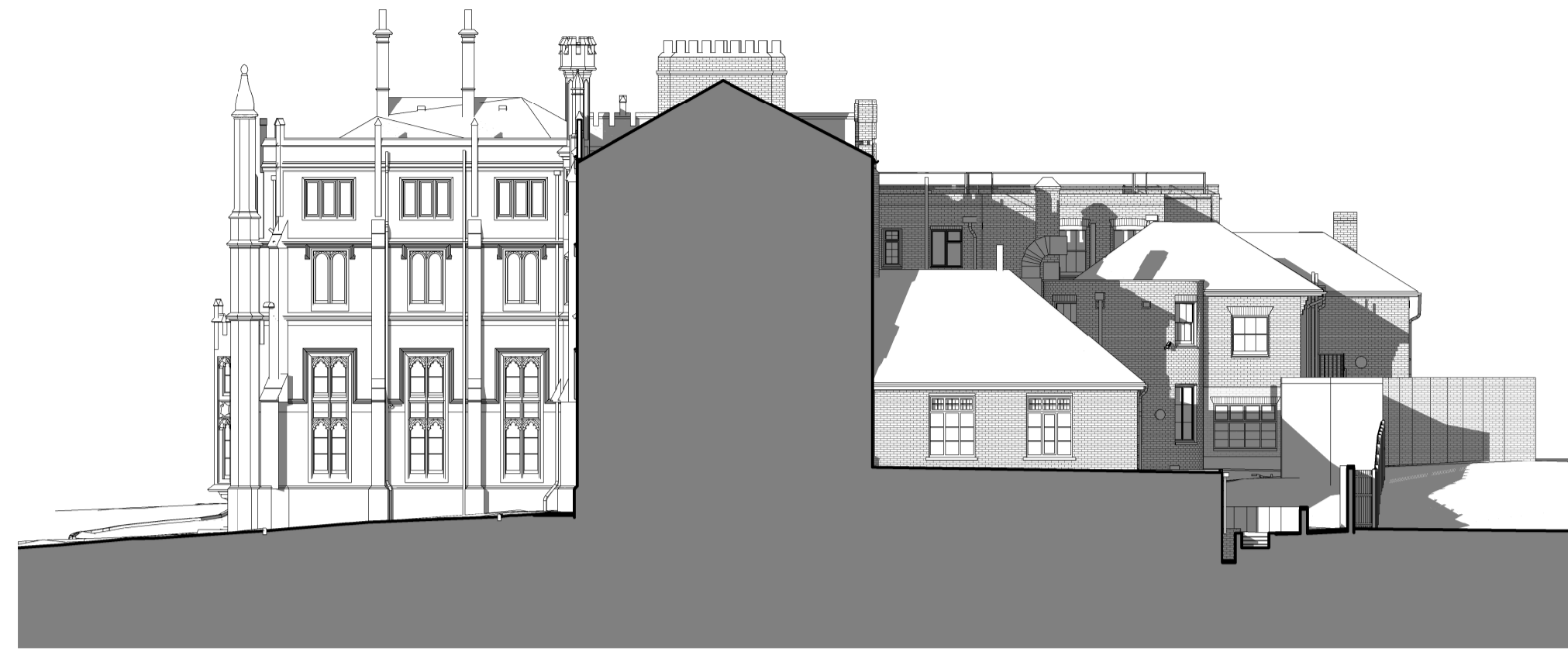
2 Main Building Section BB - Proposed (As Existing) 1:200