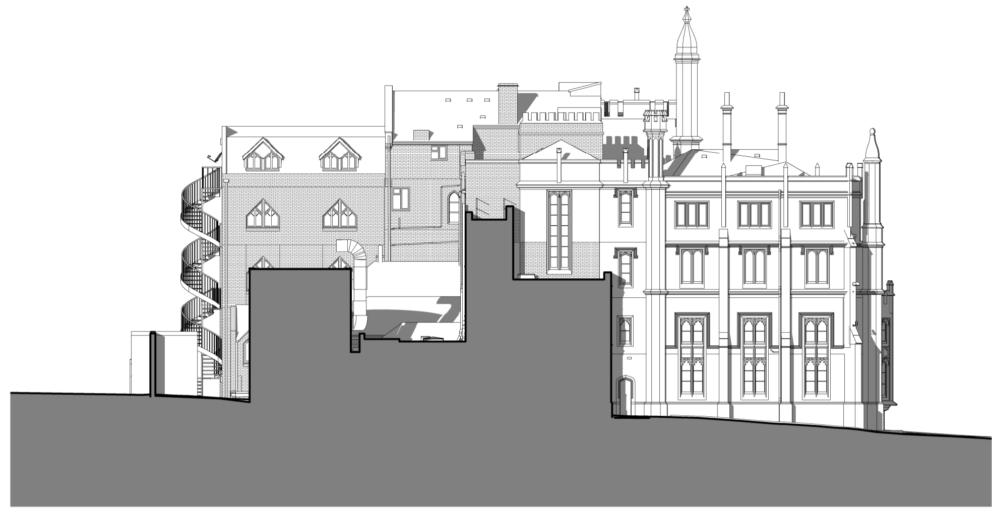
1 Main Building Section AA - Proposed (As Existing) 1:200