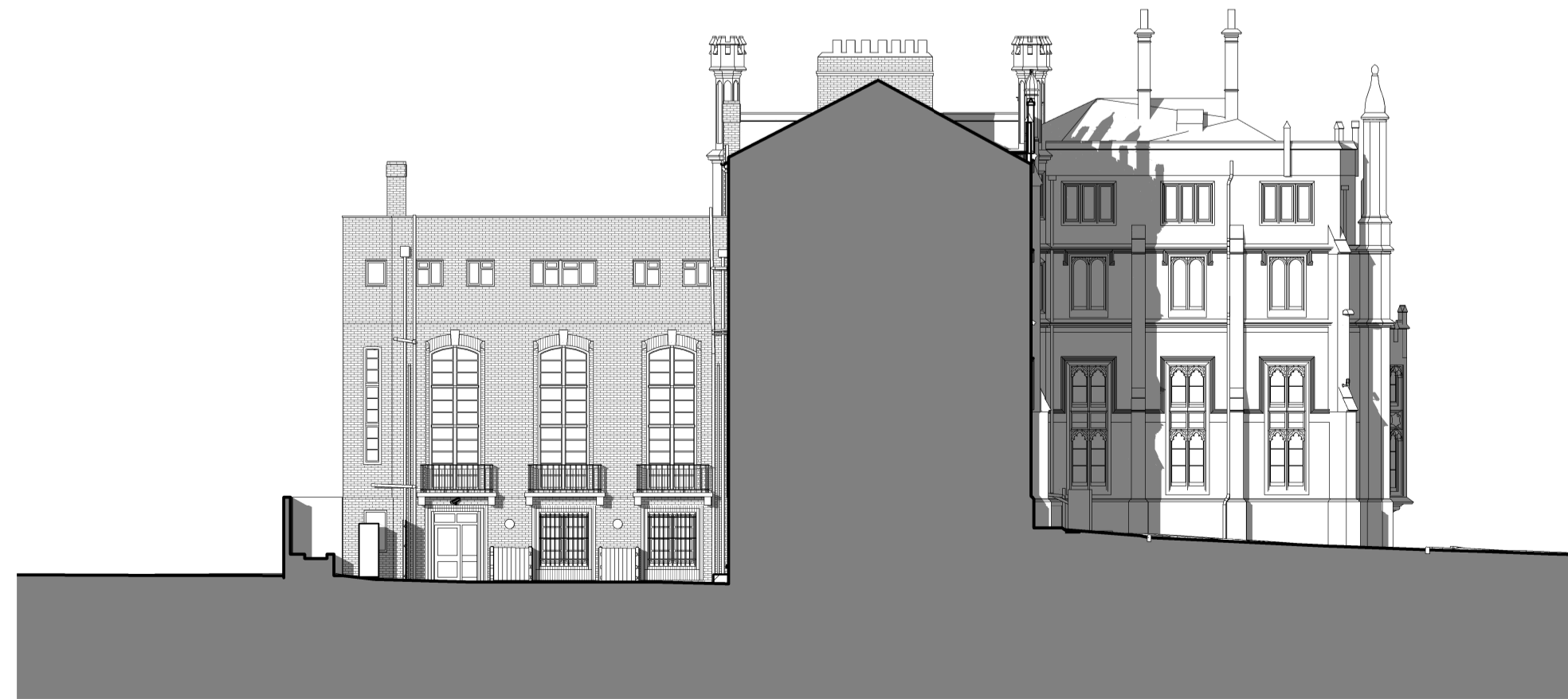
5 Main Building Section EE - Proposed (As Existing) 1:200