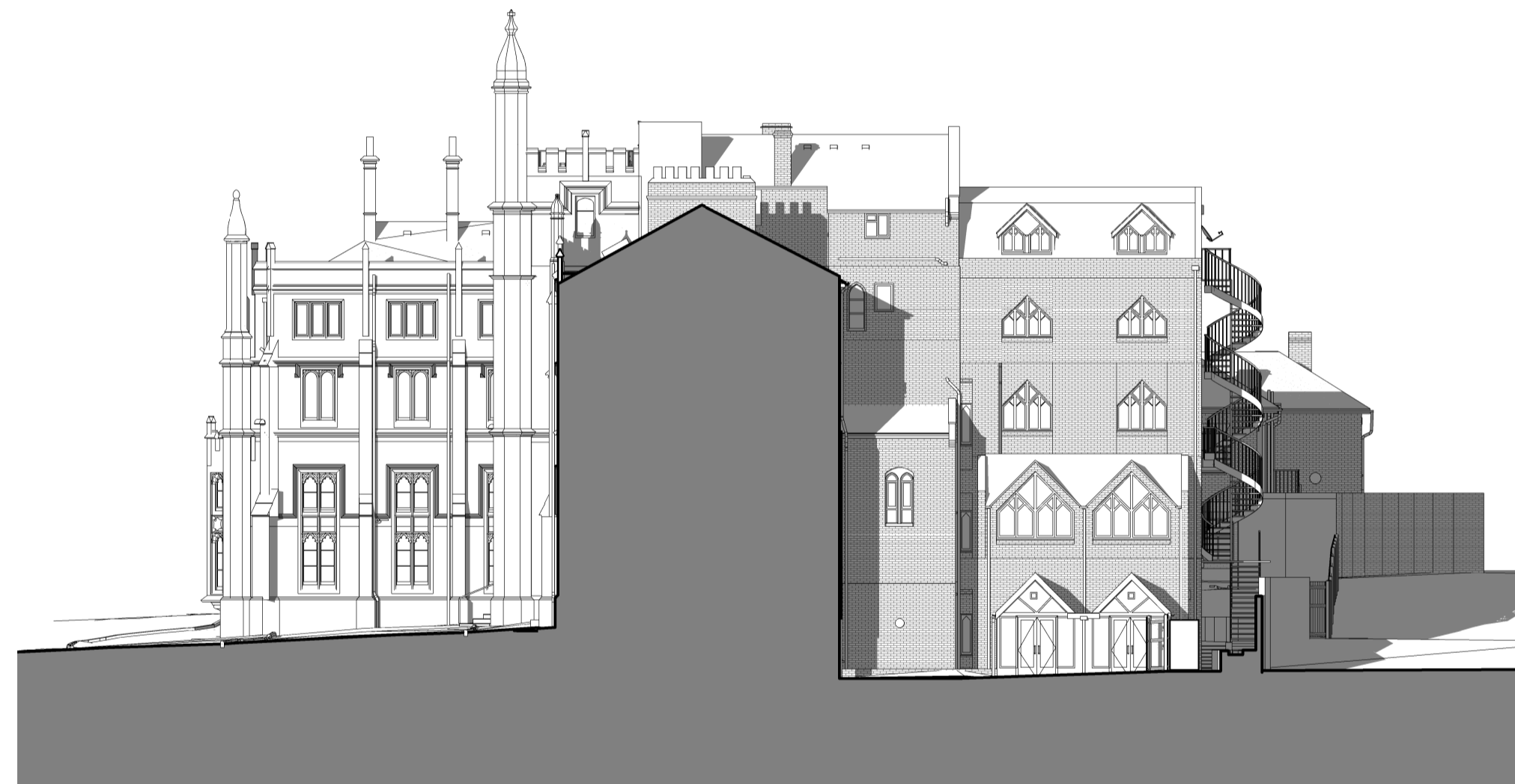
4 Main Building Section DD - Proposed (As Existing) 1:200