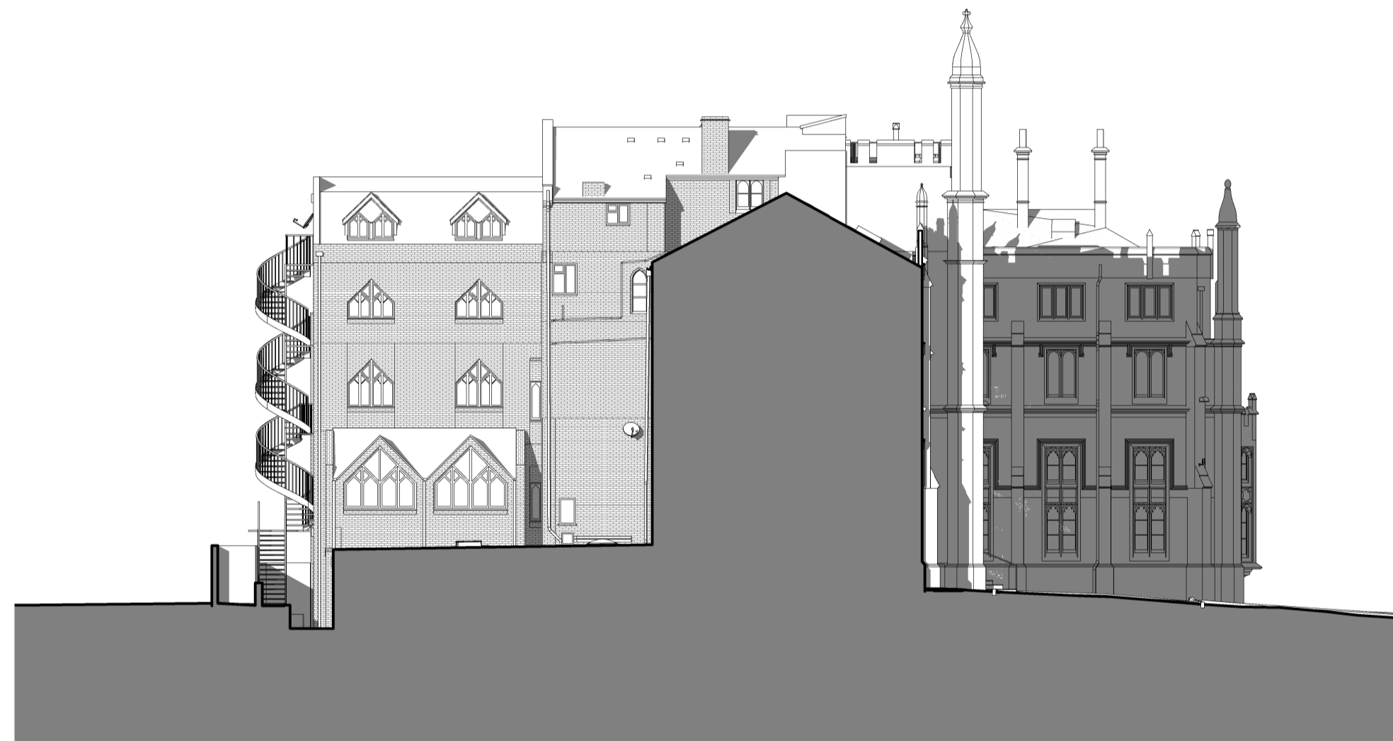
3 Main Building Section CC - Proposed (As Existing) 1:200