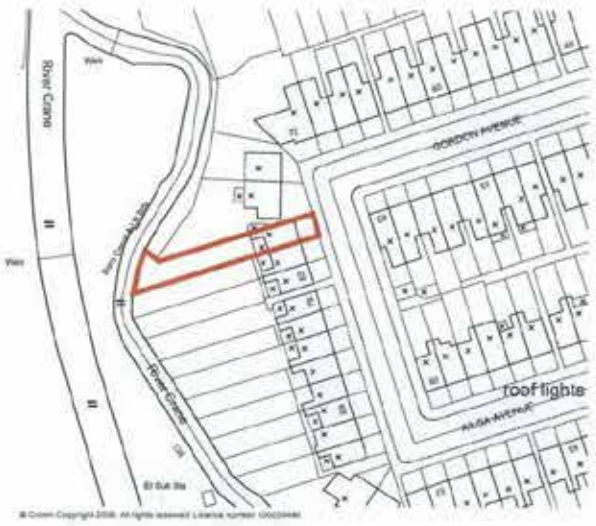
Location Plan 1:1250 (site boundary outlined in red)