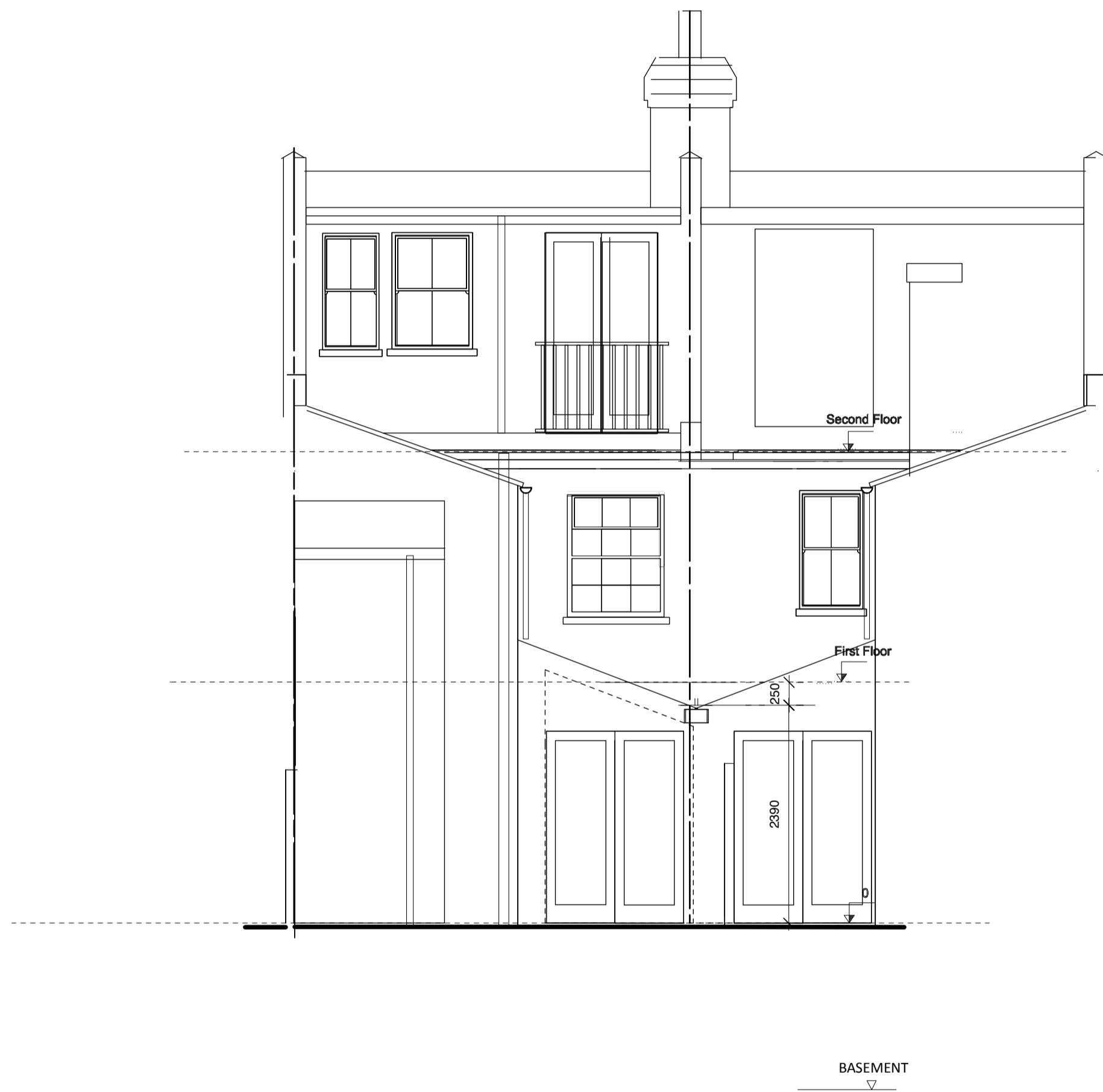
EXISTING REAR ELEVATION 1:50