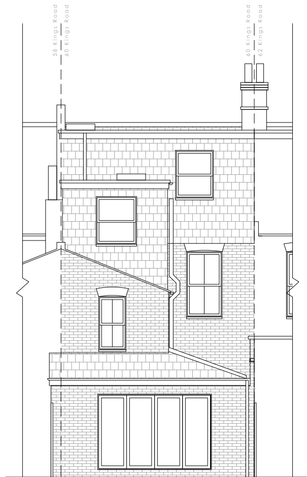
REAR ELEVATION SCALE 1:100 @ A3