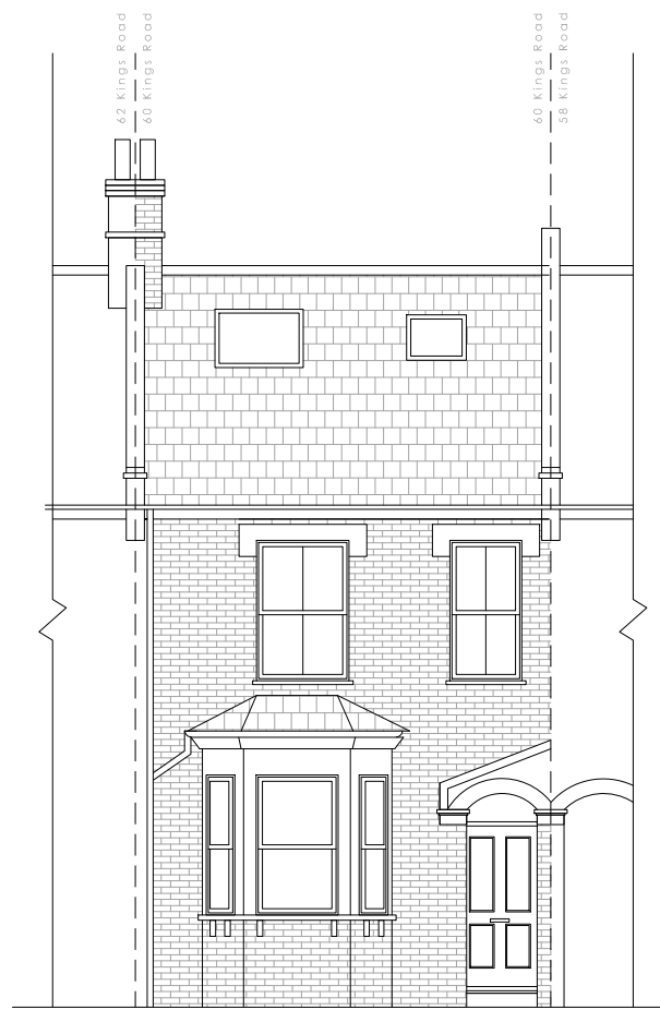
FRONT ELEVATION SCALE 1:100 @ A3