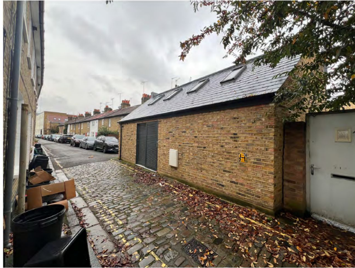
Side view from Spring Mews