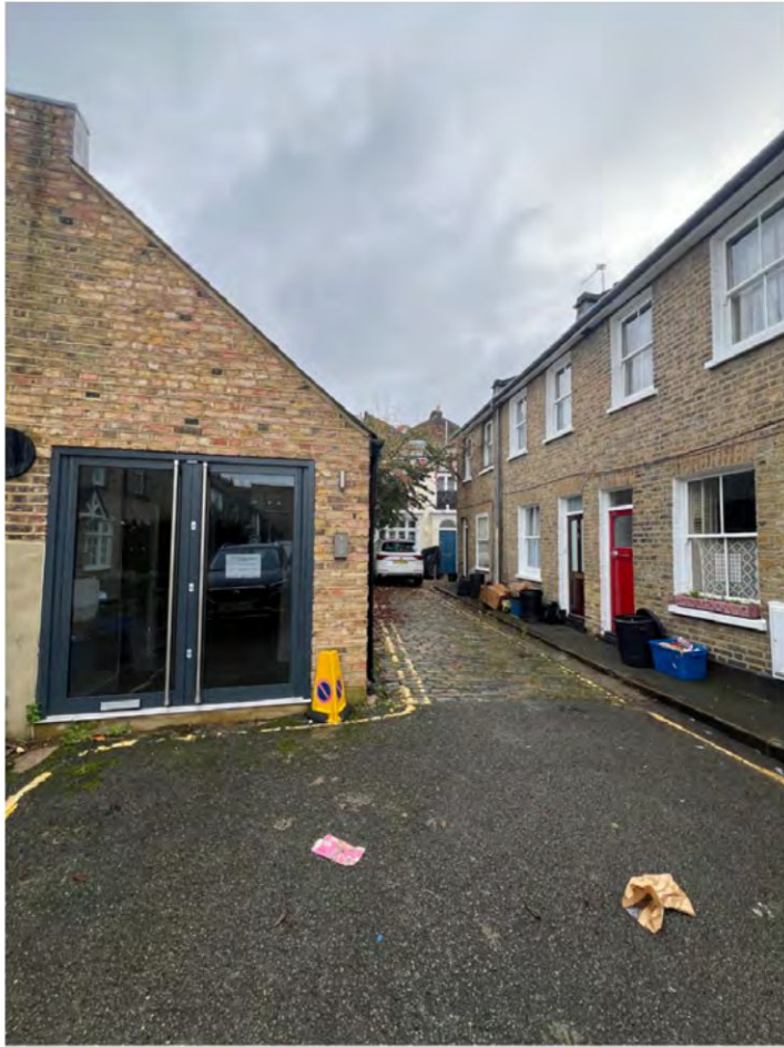
Front view from Rosedale Road