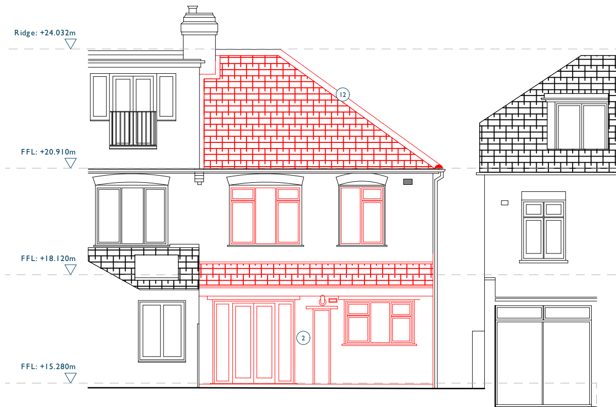
EXT Existing / Demo Elevation 3 (South) 1:100