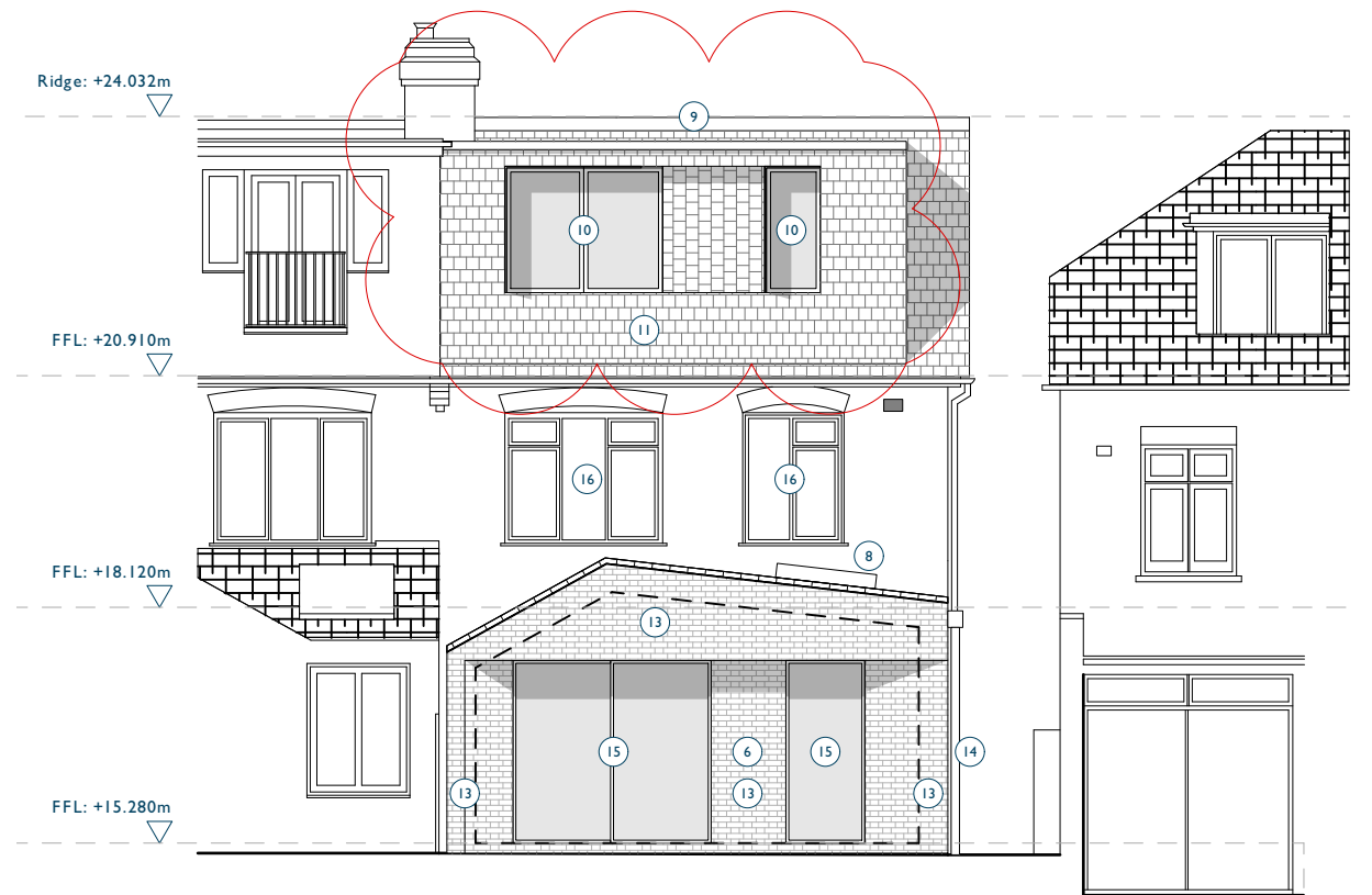
PR Proposed Elevation 3 (South) 1:100