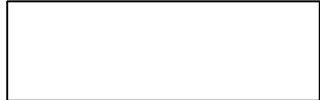
E1 18 CHURCH GROVE : Existing Front Elevation E1 (WEST) 328-GAE01 Scale: 1:50