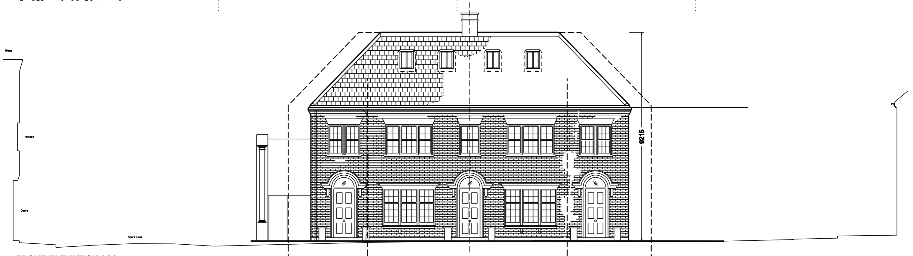
FRONT ELEVATION / 01