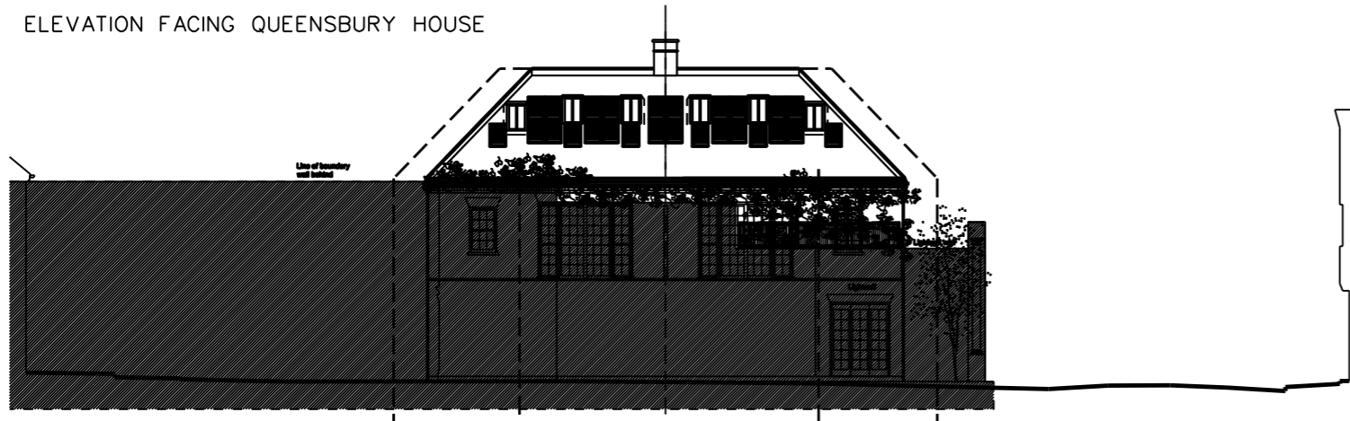
ELEVATION FACING QUEENSBURY HOUSE