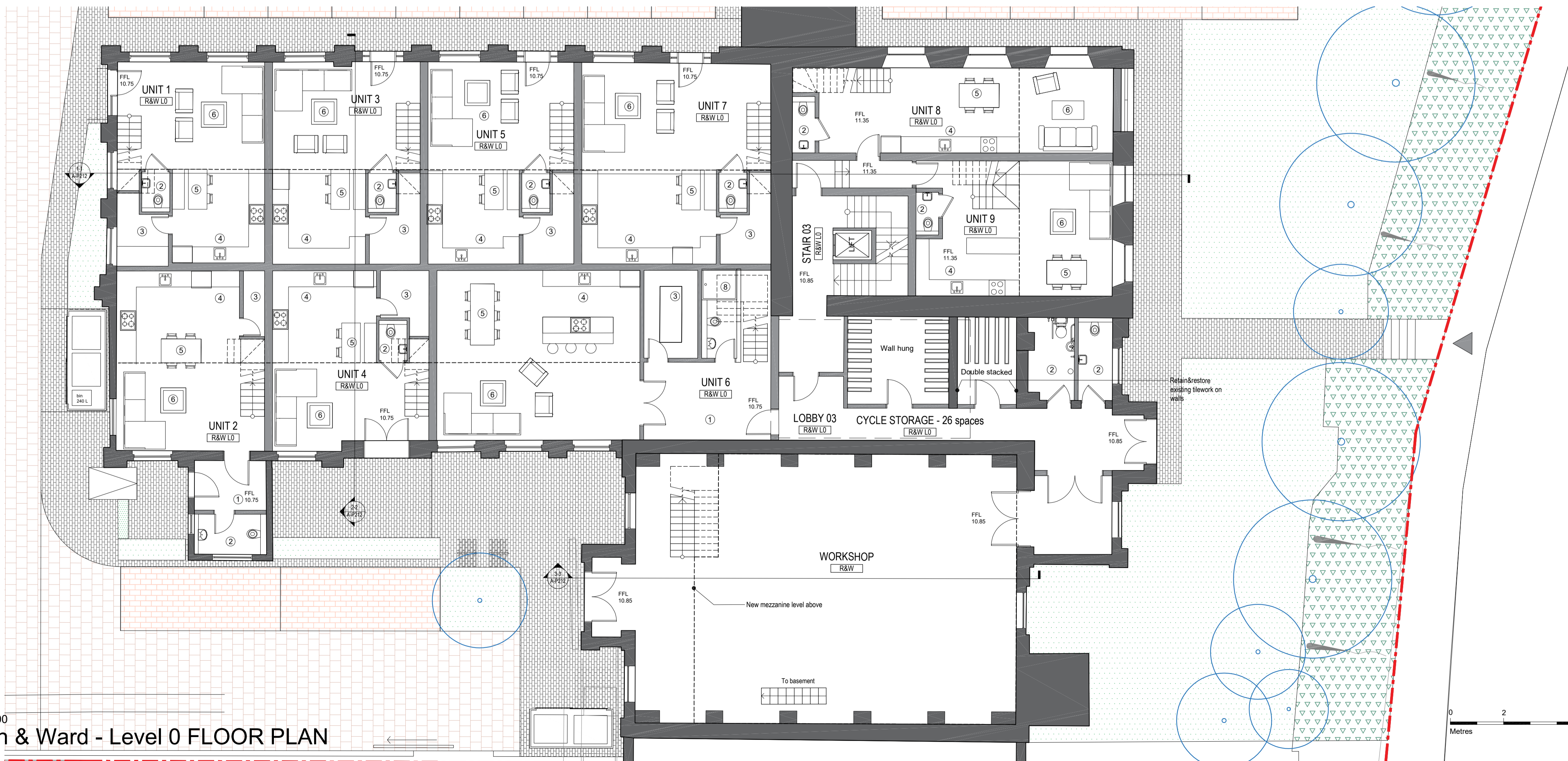
SCALE 1:100 Ruston & Ward - Level 0 FLOOR PLAN