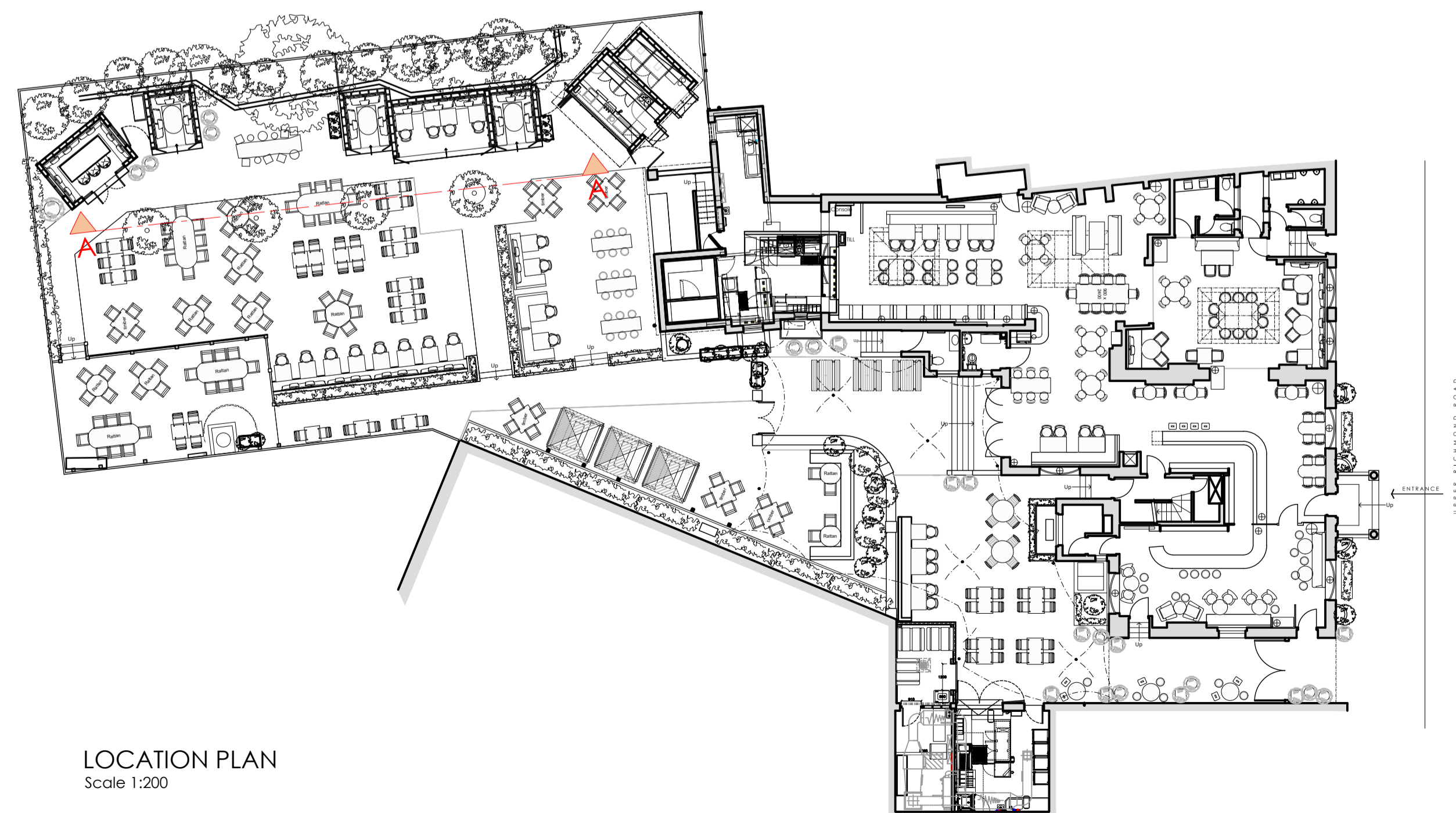
LOCATION PLAN Scale 1:200