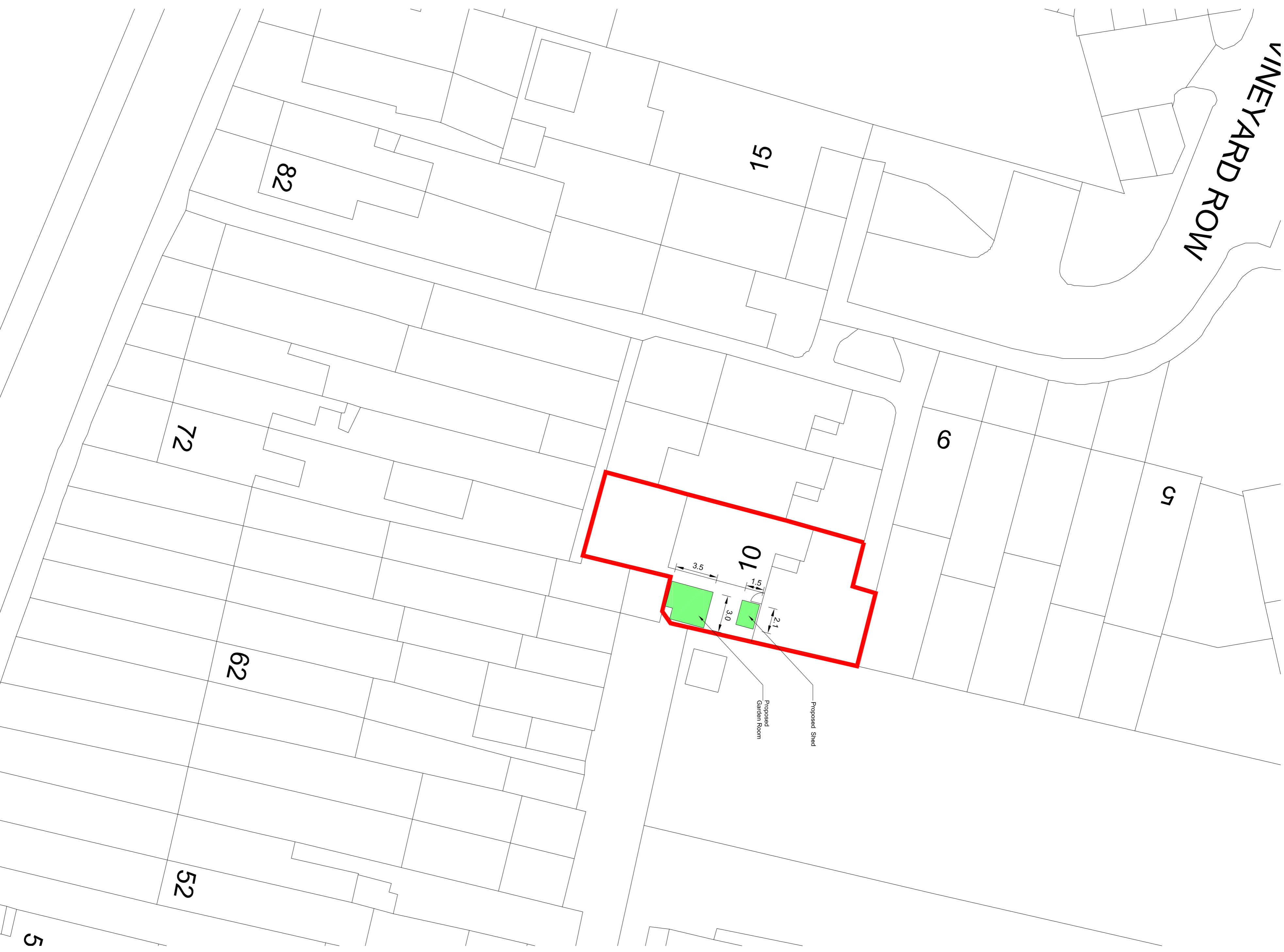
Site Plan as Proposed - 1:200