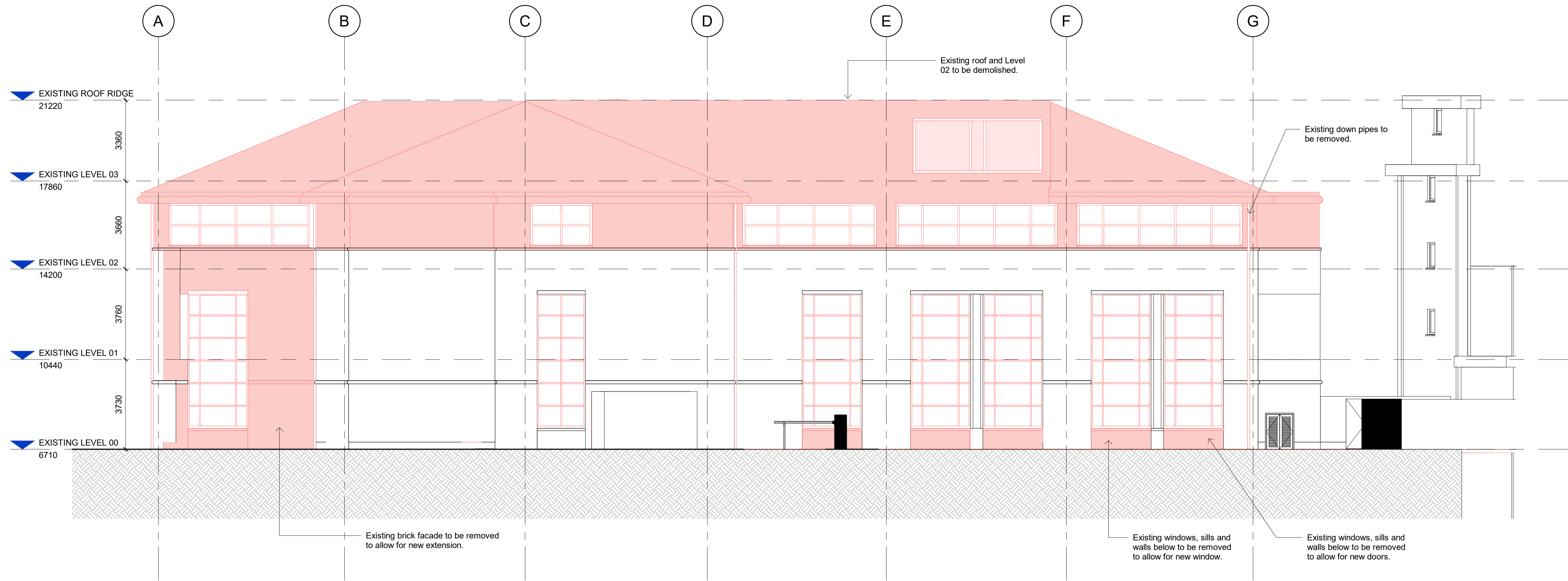
1 Demolition Elevation - South 1 : 100