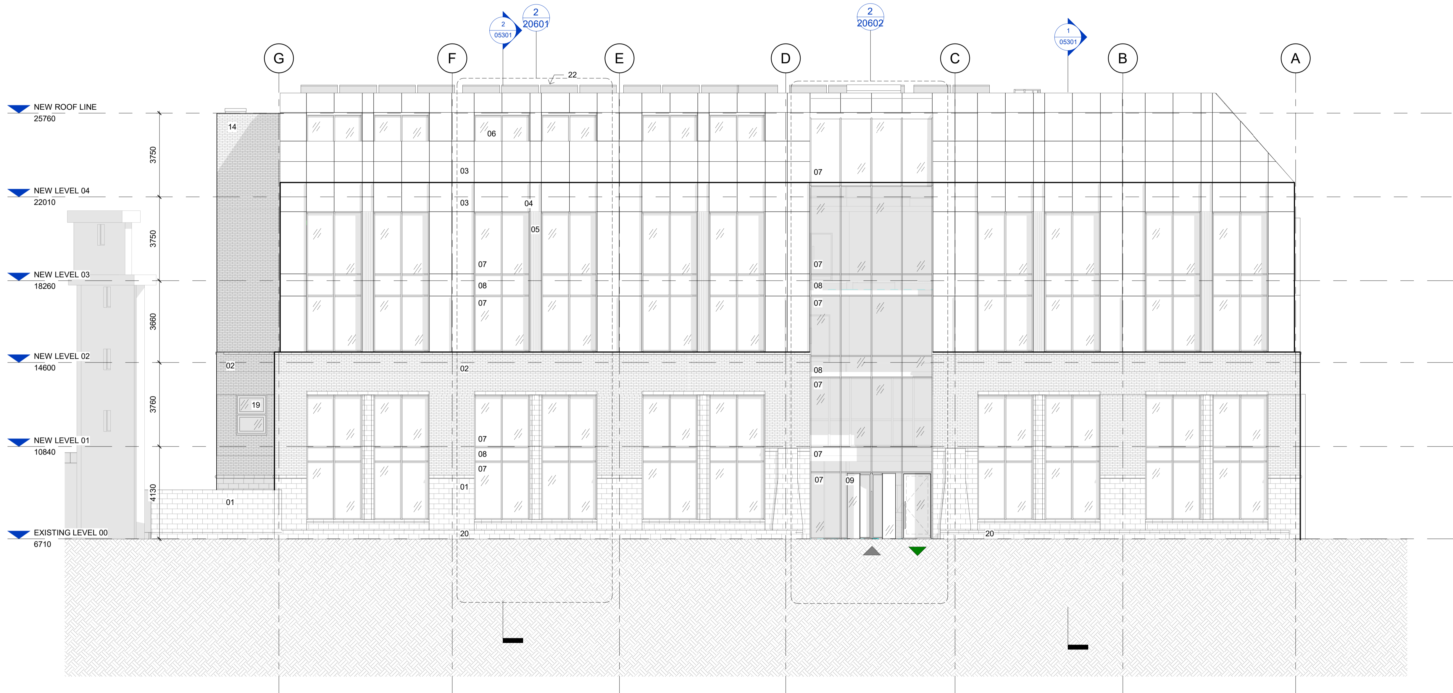
1 Proposed Elevation - North 1 : 100