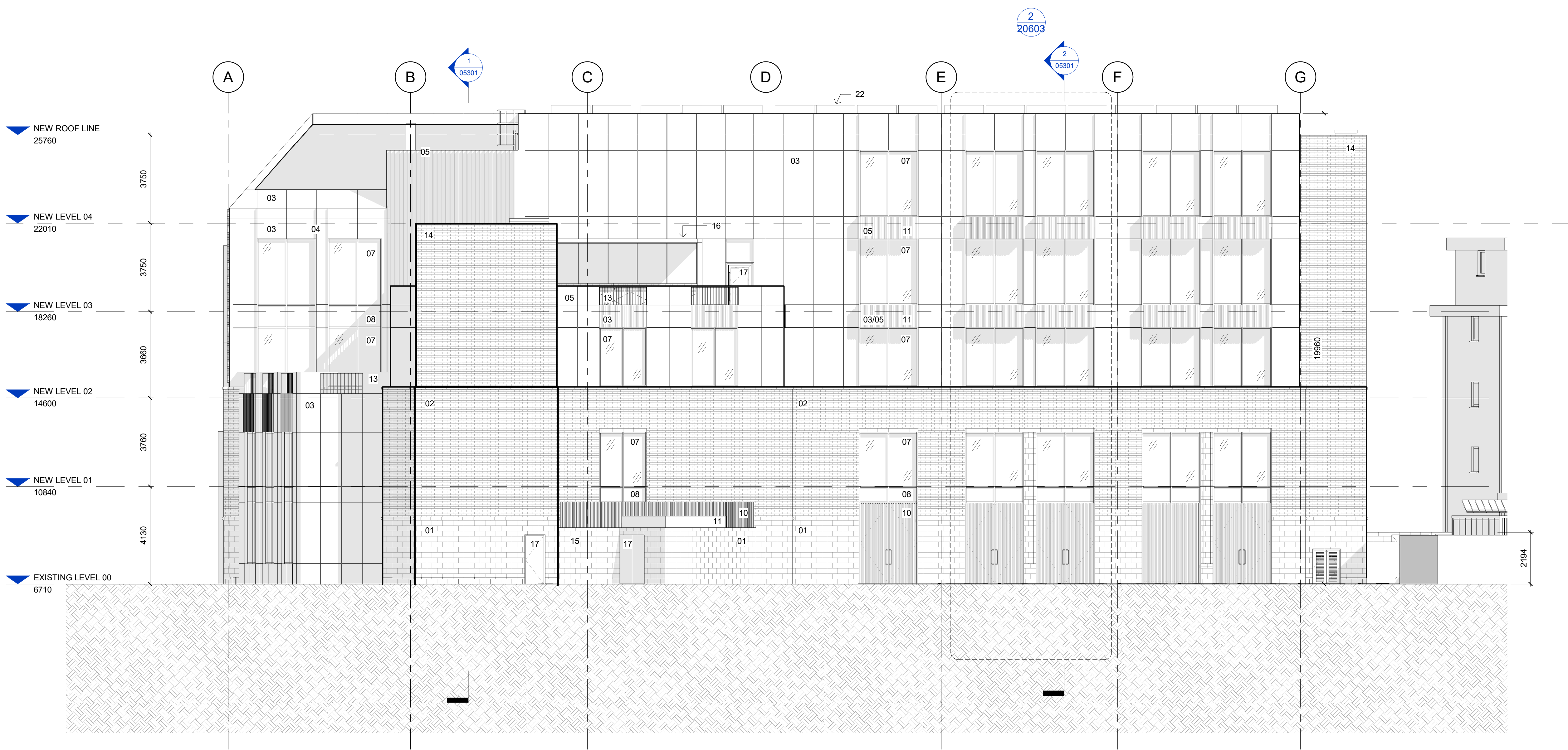
1 Proposed Elevation - South 1 : 100

Project stage Drawing number 143-ANO-P0-XX-DR-A-05402