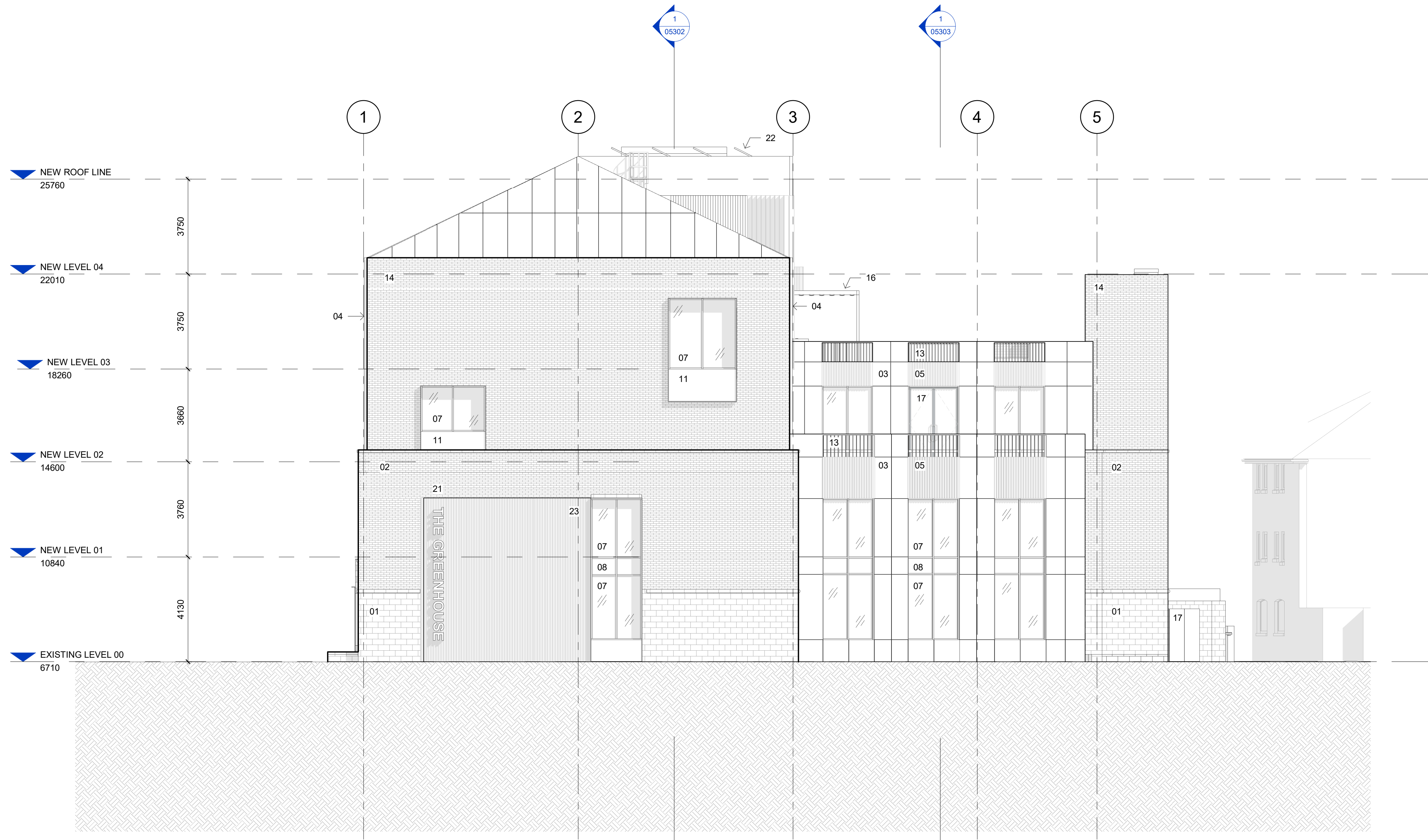
1 Proposed Elevation - West 1 : 100