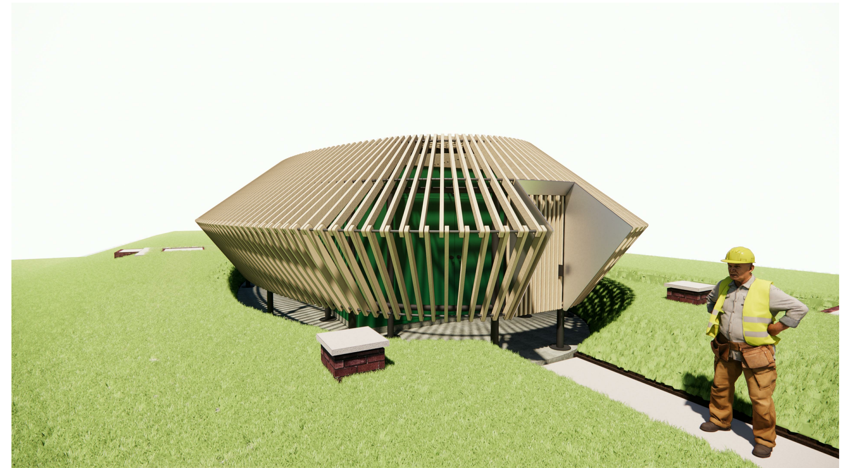
Timber screen / enclosure details - CONCEPT ONLY